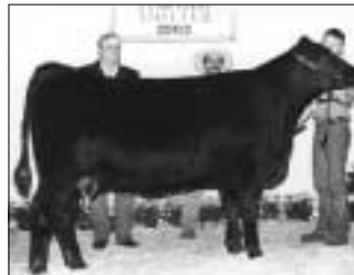
► Grand champion female, Grandview Womack Blkcap J139 , by Victoria Farm Inc., Alachua. She's an Oct. 1999 daughter of SVF GDAR 216 LTD.