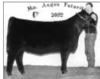
► Reserve grand champion female, Clearwater Burgess 1081 , by Clearwater Farm, Springfield. She's a March 2001 daughter of Clearwater PAF Seville 1977.