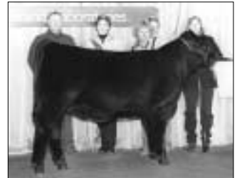
► Reserve grand champion female, MMCL Elba Queen 1318 , by Max McCuen, Yale. She's a March 2001 daughter of Circle A 2000 Plus.