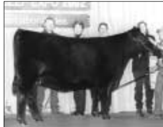
► Grand champion female, SF Lady 082 , by Clinton Brown, Creston. She's an April 2000 daughter of SF Translation.