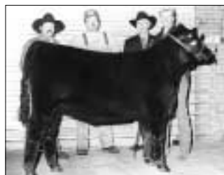
► Grand champion female, UT Miss 3211 , by University of Tennessee, Knoxville. She's a March 2001 daughter of UT Mr. 4804.