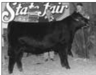
► Grand champion female, PCF of 365 Skymere 022 , by Panther Creek Farm, Pink Hill. She's a Sept. 2000 daughter of TC Stockman 365.