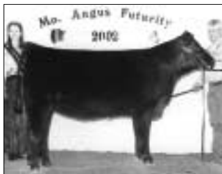
► Grand champion female, SFI Black Lass L7 , by Smith Flooring Inc., Mountain View. She's a Feb. 2001 daughter of Sitz SLS Rainmaker 7596.