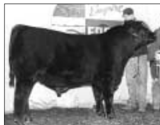
► Grand champion bull, Chestnut Famous 16 , by Chestnut Angus Farm, Pipestone, Minn. He's a Feb. 2001 son of Famous 7001.