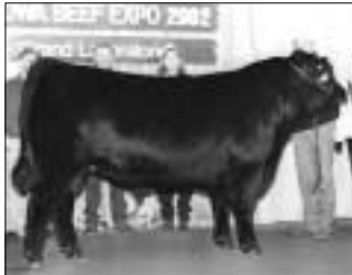
► Grand champion bull, Heartland Herdsman 025 , by Heartland Angus, Iowa City. He's a Feb. 2000 son of Heartland Herdsman 365 805.