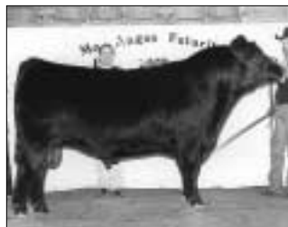
► Reserve grand champion bull, KWCC 71 Traveler 0006 , by Kissee & Wallace Cattle Co., Mount Vernon. He's a Jan. 2000 son of GDAR Traveler 71.