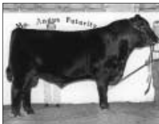
► Grand champion bull, SFI Seville K61 , by Smith Flooring Inc., Mountain View. He's a March 2000 son of Clearwater PAF Seville 1977.