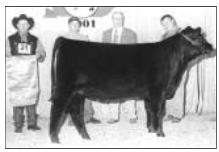
Grand champion female, Davis Beauty 0505 , by Davis on the Highlands, Springfield. She's a Jan. 2000 daughter of VDAR Ambush 1465 SAF.