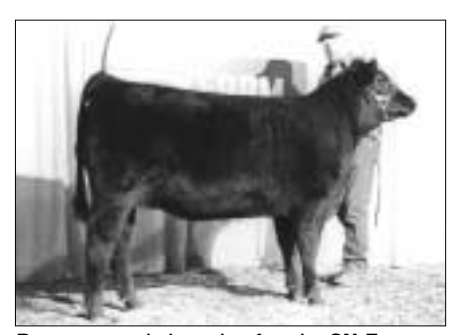
Reserve grand champion female, CN Famous Beauty 10, by Chestnut Angus Farm, Pipestone, Minn. She's a Feb. 2000 daughter of Famous 7001. CONTINUED ON PAGE 178