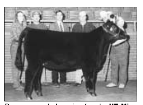
Reserve grand champion female, UT Miss 3550 , by the University of Tennessee, Knoxville. She's a March 2000 daughter of UT Mr. 4804.