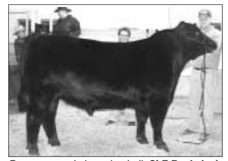
Reserve grand champion bull, SLF Backslash 1029 , by Springlake Farm, Kingston, III. He's a March 1999 son of OCC Backstop 888B.