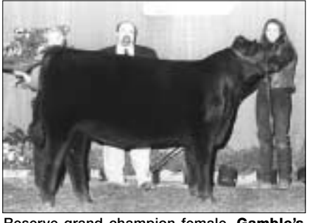
Reserve grand champion female, Gamble's Famous Phyllis 614 , by Holly Gamble, Clinton. She's a March 2000 daughter of Famous 7001.