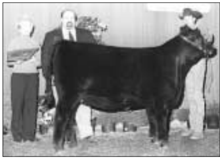
Grand champion female, Grandview Womack Duchess , by Wesley Womack, Pembroke, Ky. She's a Feb. 2000 daughter of Berryessa C600.