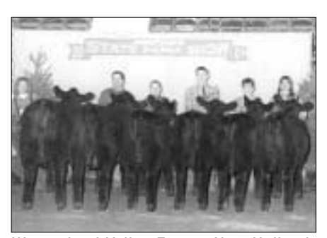
Weaverland Valley Farms, New Holland, showed the best six head. They were also named the premier breeder at the show.