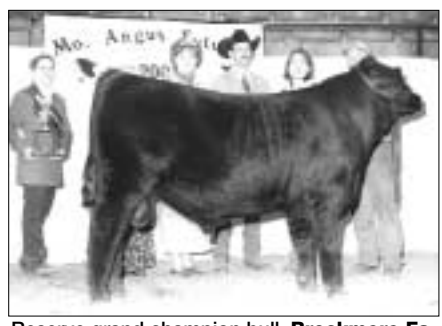
Reserve grand champion bull, Brockmere Famous 1, by Brockmere Farms Inc., Brookfield. He's a Jan. 2000 son of Famous 7001.