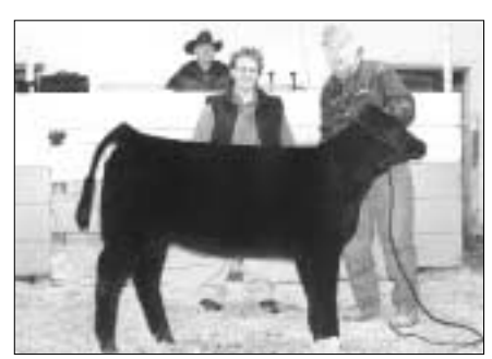
Grand champion female, MCA Trendy Medal lion 00, by Macauleys Curview Angus, Oregon, III. She's an Aug. 2000 daughter of MCA Gold Medallion 98.