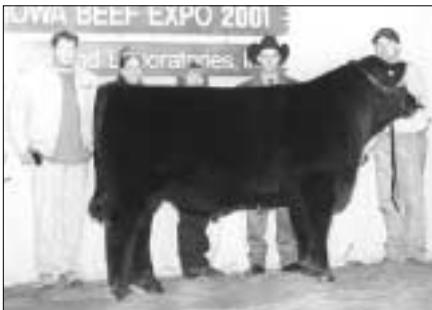
Grand champion bull, Heartland Herdsman 020, by Heartland Angus, Iowa City. He's a Feb. 2000 son of Heartland Herdsman 365 805.