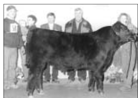
Reserve grand champion bull, Weaverland Explorer 05 , by Weaverland Valley Farms, New Holland. He's a Feb. 2000 son of Leachman Explorer.