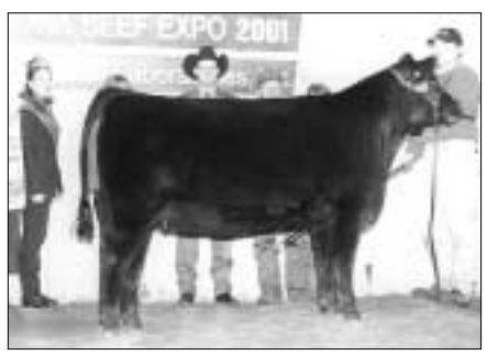
Grand champion female, K&A Marsha K069, by K&A Farm, Blakesburg. She's a Jan. 2000 daughter of K&A Mainline F18 of JAC's.