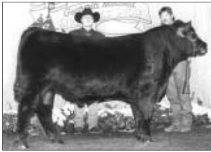
Reserve grand champion bull, Knop's Advantage 007-404 , by Magnolia Plantation, McDonough. He's a Jan. 2000 son of TC Advantage.