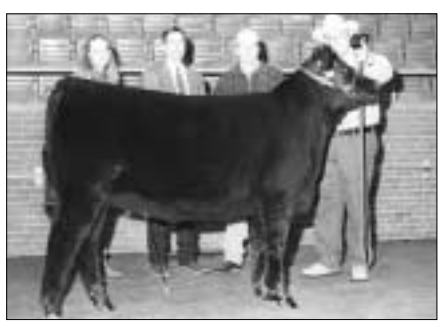
Grand champion female, UT Miss 1410 , by the University of Tennessee, Knoxville. She's a Jan. 2000 daughter of TC Stockman 365.