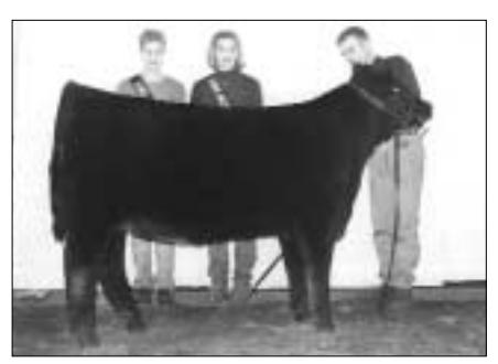
Grand champion female, PVF Perfection 021 , by Prairie View Farm, Gridley. She's a March 2000 daughter of Dameron PVF Raptor 702.