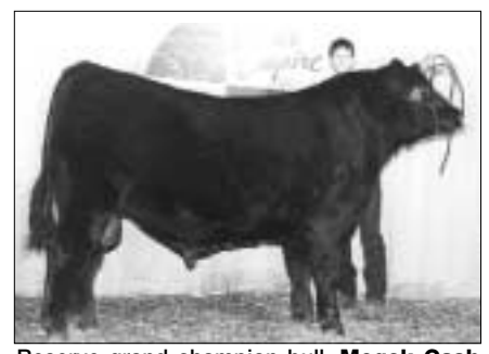
Reserve grand champion bull, Mogck Cash C839, by Mogck & Sons, Olivet, S.D. He's a Feb. 1999 son of SAF Cash 7203.