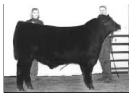
Reserve grand champion bull, Murphy's Medallion 10J, by Murphy's Angus, Illiopolis. He's a March 2000 son of SVF GDAR 216 LTD.