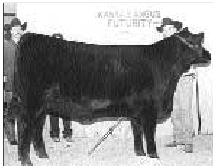
Grand champion owned female, Green's Blackcap 7172 , by Cody Sankey. She's an April '97 daughter of Green's Stetson 9182.