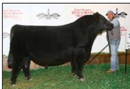
Reserve senior champion EXAR Express Way 1079B, by Express Angus Ranches, Yukon, Okla.