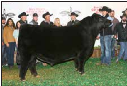
Grand champion bull Silveira's Convoy 0340