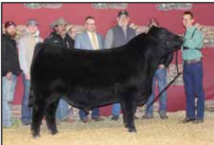
Grand champion bull Conley DS Clear Cut 0510