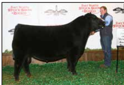
Intermediate champion Seldom Rest Regulate 0105, by Seldom Rest Farms, Niles, Mich.