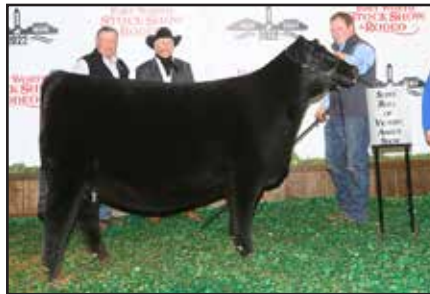
Grand champion female Seldom Rest Pin Up Gal 0002