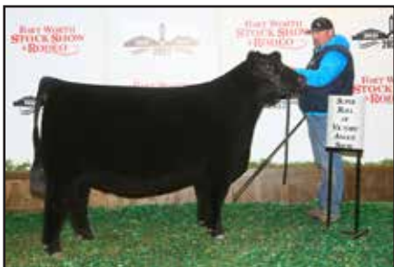
Reserve intermediate champion EXAR Frontier Gal 0732, by Londyn Slaughter, Savoy, Texas