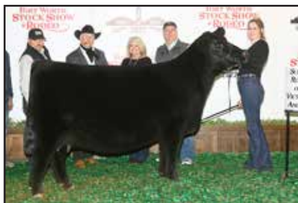
Reserve grand champion female SSF Lady 5030