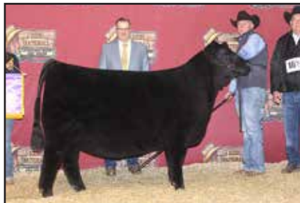
Grand champion female EXAR Frontier Gal 2110