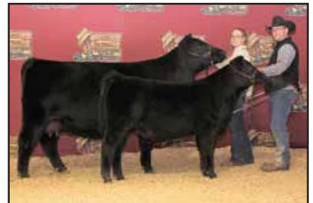
Grand champion cow-calf pair AED Rita 821F