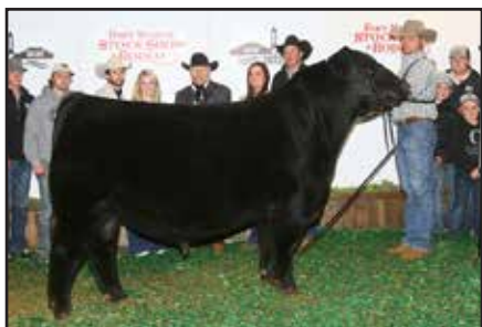
Reserve grand champion bull Conley Lead The Way 0738