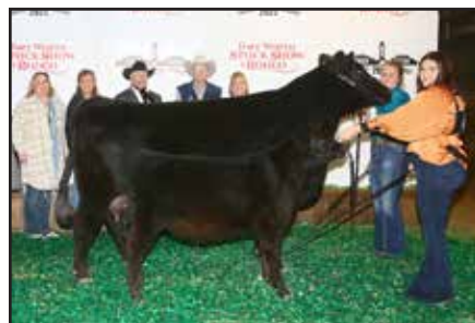
Reserve grand champion cow-calf pair Lazy JB Blackcap 732