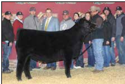
Reserve grand champion female BCR Phyllis 092J