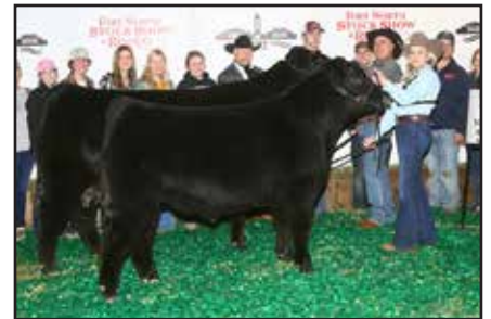
Grand champion cow-calf pair SJH Roundtable of 9633 7100