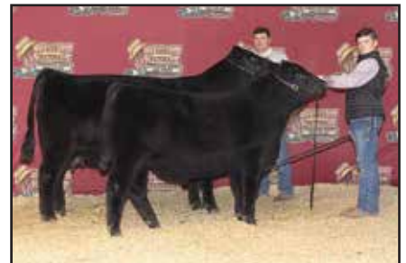
Reserve grand champion cow-calf pair WCC Primrose F40