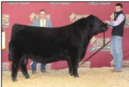
Reserve grand champion bull Seldom Rest Regulate 0105