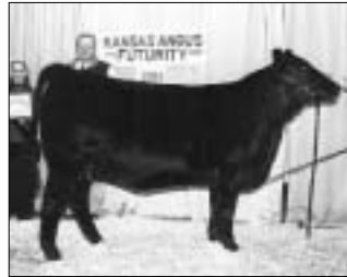
► Grand champion female, KSU Miss Supreme 2153 , by Kansas State University, Manhattan. She's a Feb. 2002 daughter of Schurrtop Supreme.