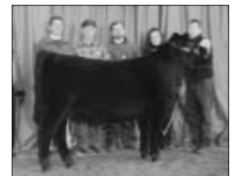
► Reserve grand champion female, Moffitt Queen Elba 20N , by Craig Moffitt, Colfax. She's an April 2003 daughter of Twin Valley Precision E161.