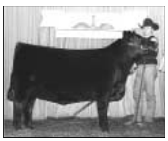
Senior calf champion, Champion Hill Lady 2185, by Champion Hill, Bidwell, Ohio; and Fox Cross Farm, Alderson, W.Va. She's a Sept. 2000 daughter of Leachman Saugahatchee 3000C.