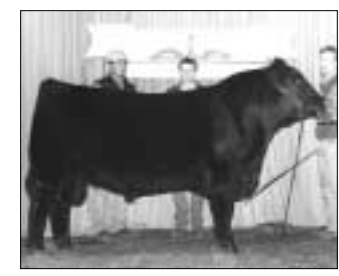
Intermediate champion, Moffitt Stocker 0030 of PF, by Pollard Farms LLC, Enid, Okla.; and Moffitt Angus Farms, Colfax, Iowa. He's a May 2000 son of TC Stockman.