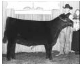
▶ Junior calf champion, Champion Hill Georgina 2335 , by Champion Hill, Bidwell, Ohio; and Fox Cross Farm, Alderson, W.Va. She's a Jan. 2001 daughter of Leachman Saugahatchee 3000C.