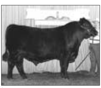
Reserve intermediate champion, RSR Expedition 130, by Rising Sun Ranch, Marquez, Texas. He's a June 2000 son of Rito 9FB3 of 5H11 Fullback.