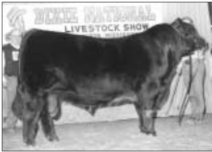
(l) Reserve senior champion bull, MT Valley Fullback 810 , by Wilson Cattle Co., Cloverdale, Ind. He's a May 1998 son of Rito 9FB3 of 5H11 Fullback.