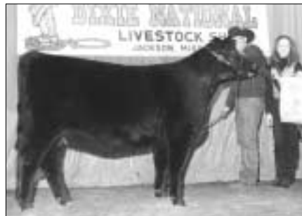
Reserve intermediate champion female, Broken Arrow Forever Lady 921 , by Broken Arrow Ranch, Lincoln, Calif.; and Roth Angus, Freeman, S.D. She's a July 1999 daughter of GDAR SVF Russ 184B.