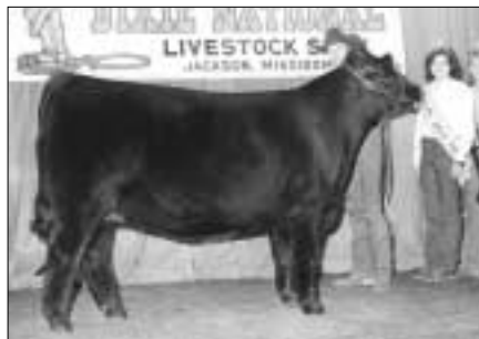
Reserve junior champion female, Grandview Womack Blackbird , by Wesley Womack, Pembroke, Ky. She's an April 1999 daughter of TC Stockman 365.