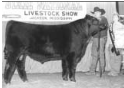
Junior calf champion bull, Roth Famous 031 , by Roth Angus, Freeman, S.D. He's a Jan. 2000 son of Famous 7001.