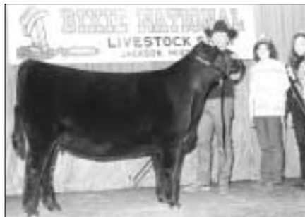
Intermediate champion female, Champion Hill Georgina 1690 , by Champion Hill, Bidwell, Ohio; and Fox Cross Farm, Alderson, W.Va. She's a July 1999 daughter of Leachman Saughatchee 3000C.