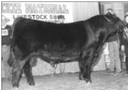
(l) Reserve junior champion bull, TC Extra 9140 , by Kiowa Creek Ranch, Elbert, Colo.; TC Ranch Inc., Franklin, Neb.; and Wilson Cattle Co., Cloverdale, Ind. He's a Feb. 1999 son of TC Stockman 365.