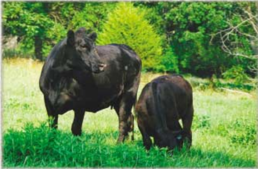
Young cows that calve at BCS 3 or 4 can't gain enough condition to achieve the same rebreeding performance as cows that calve at BCS 5 or 6.

conception, which will help them keep to the same schedule as the more mature cows in subsequent years.