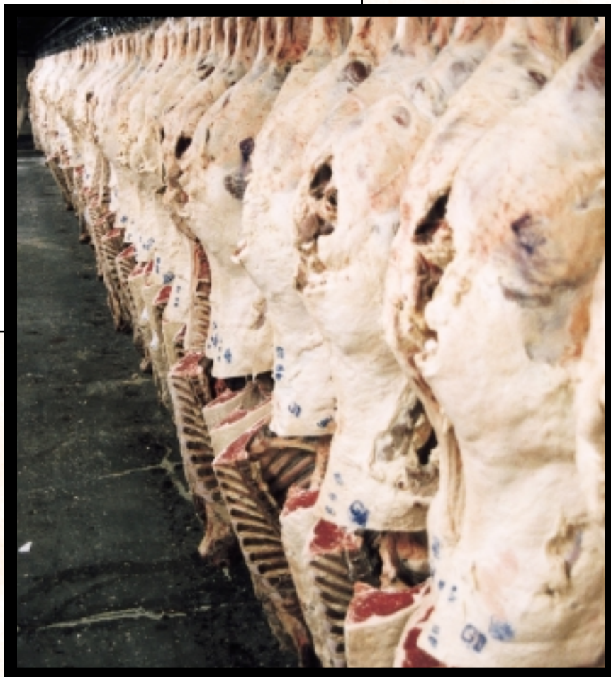
In integrated systems, participants can document carcass and feedlot performance, which some producers view as more of an incentive than specific economic premiums.

In sum, serving as an information relay, the Butlers were able to help customers get more bids on their cattle and to help some start documenting feeding and carcass performance. Today the Butlers use the same approach by compiling information about customer calves and sending a feeder-calf directory to feedlots. With these efforts, Stacy explains, "It has created for us long-term relationships with customers committed to our bulls."