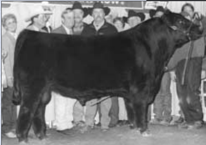
Reserve grand and junior champion bull Northern Improvement 4480 GF