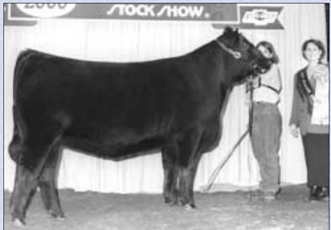
Intermediate champion female Car Don Miss Evergreen B454