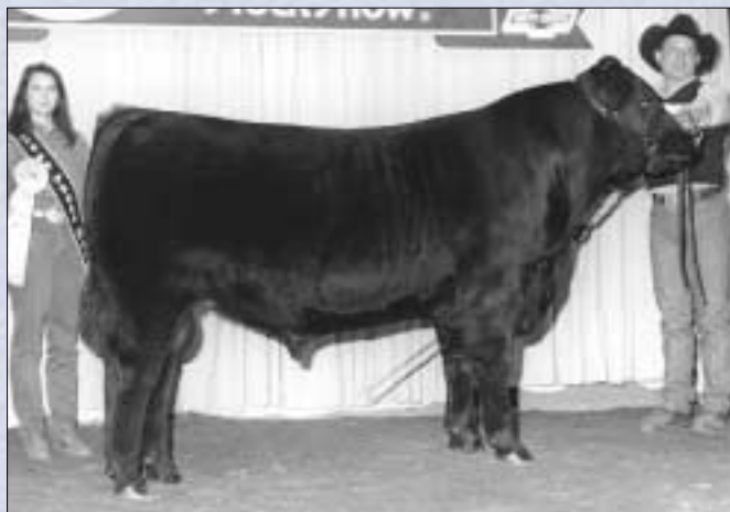
Reserve senior bull calf champion G13 Stockman 8350