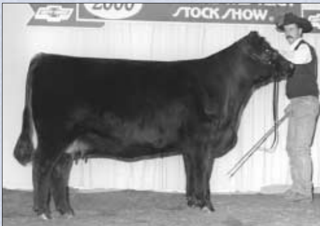
Reserve senior champion female KWCC Lucy 7118