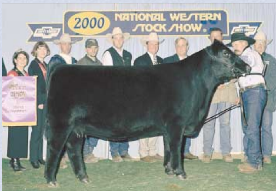
Grand and junior champion female BT Everelda Entense 166H