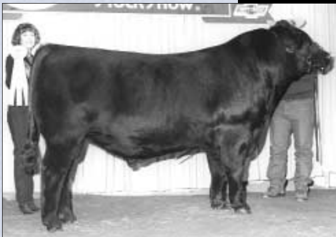
Reserve intermediate champion bull WA BT Emperor 804