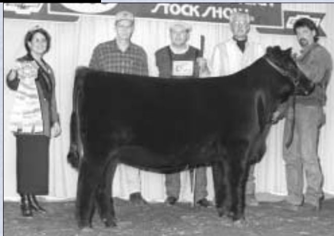
Spring heifer calf champion Champion Hill Lady 1530