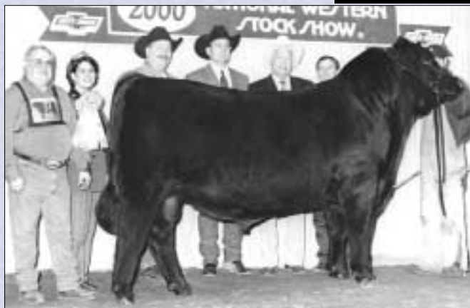
Grand and junior champion bull WCC Checkers H339