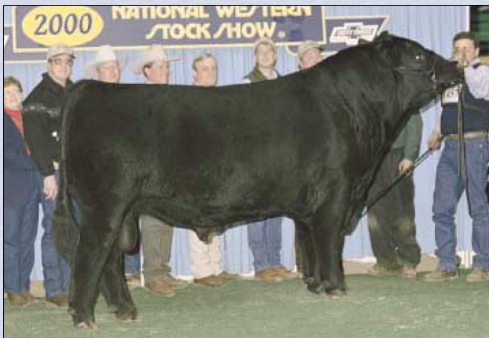
Grand and senior champion bull Famous 7001