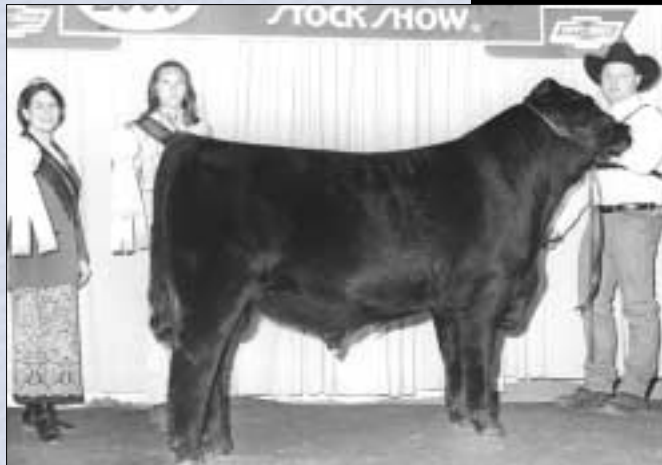
Reserve winter bull calf champion Boyd Stockbull 9067