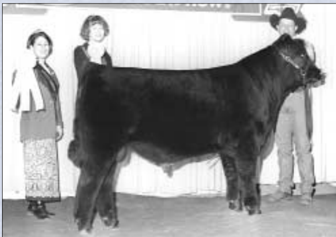
Reserve spring bull calf champion G13 Stockman 9023