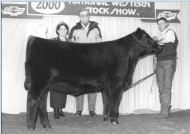
Reserve senior heifer calf champion Champion Hill Sunshine 1332