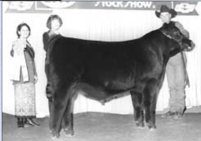
Spring bull calf champion Bush's Big Daddy