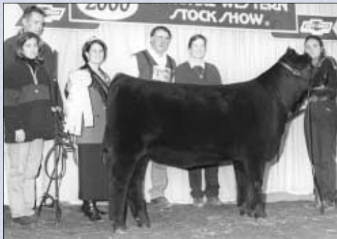
Reserve spring heifer calf champion Dameron Effie 9116