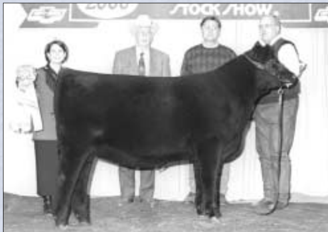
Winter heifer calf champion WAF Missie 9057