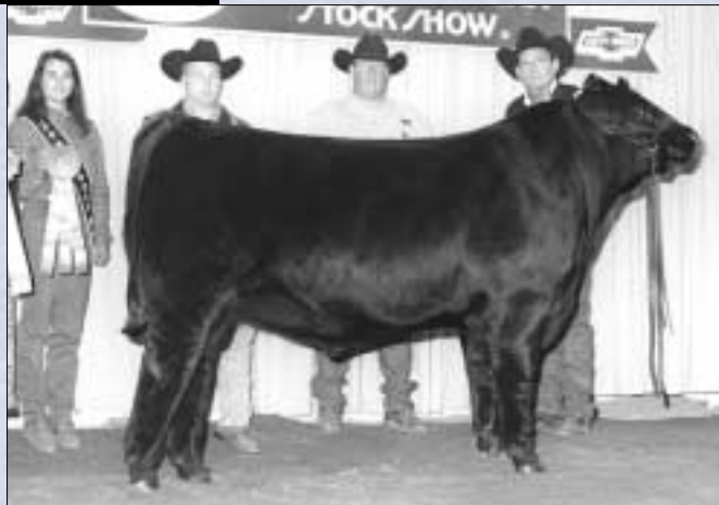
Senior bull calf champion EXAR Scotch Cap 816