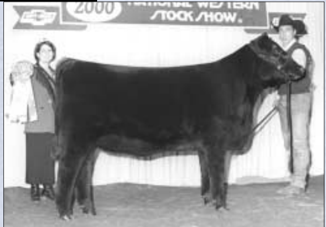
Senior heifer calf champion JAC's Toreby Queen 8302