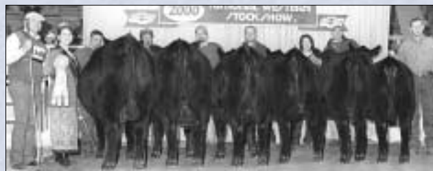
Best six head — Champion Hill