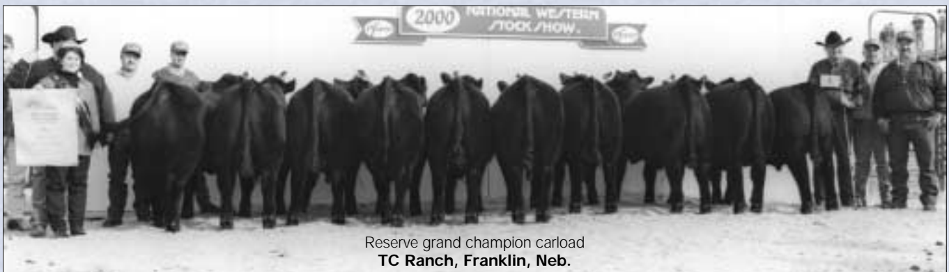
Reserve grand champion carload TC Ranch, Franklin, Neb.