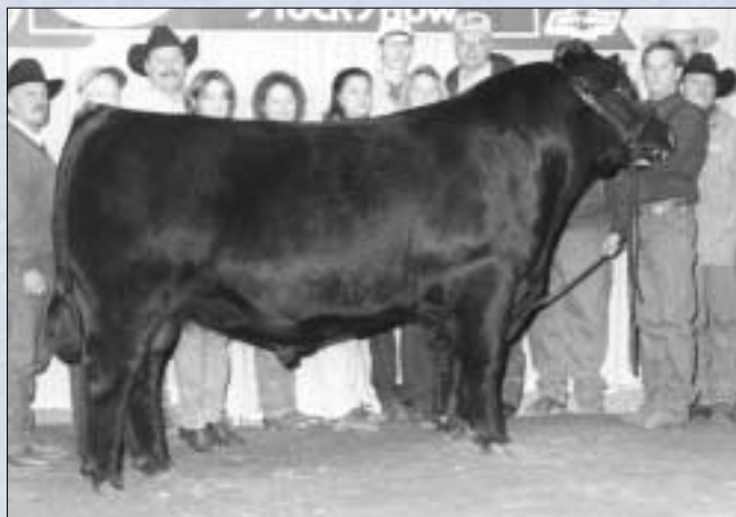
Intermediate champion bull Maple Lane Forever Ready 850