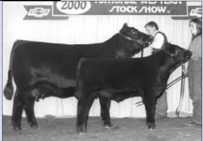
Senior champion female MLA Forever Lady 148