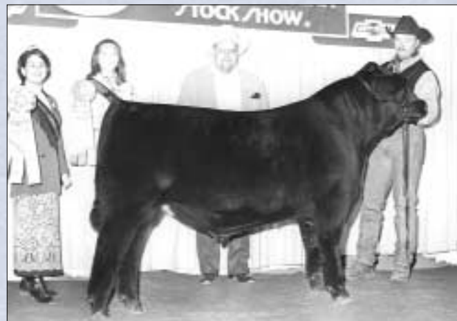
Winter bull calf champion WK Online 9191