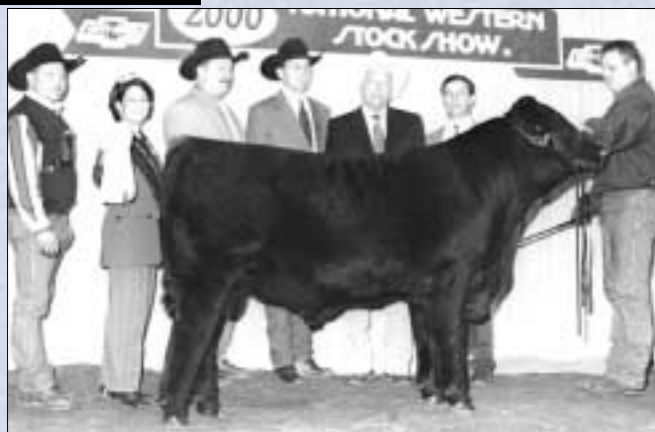
Reserve grand and early spring calf champion bull Boyd Stockbull 9067

GRAND: WCC Checkers H339, junior champion.