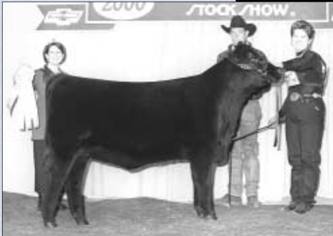
Reserve winter heifer calf champion DAJS Faline J902