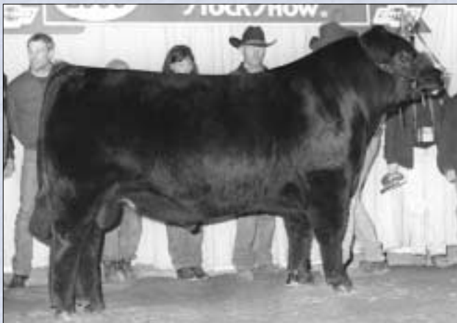
Reserve junior champion bull CCC Krugerrand Kujoe 855