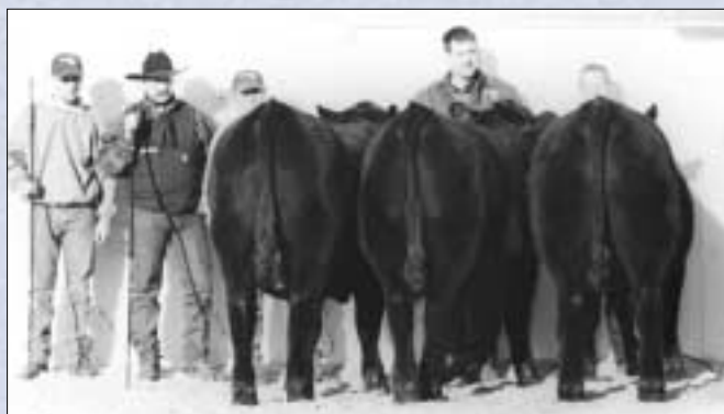
Grand champion pen Beartooth International, Columbus, Mont.