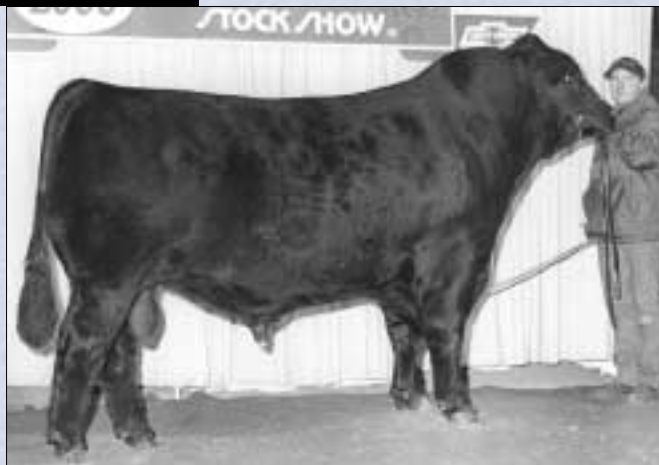
Reserve senior champion bull WK Appeal