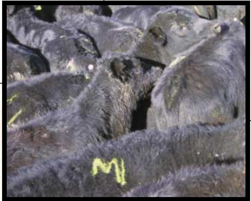
Most, but not all, of the cattle to sell in 1999, 2000 and 2001 were or will be sired by alliance Angus bulls. Already impressive, genetic consistency at the alliance calf sales will improve as NMoABA members set EPD parameters and require exclusive use of alliance Angus bulls.

Most, but not all, of the cattle sold in 1999, 2000 and 2001 were or will be sired