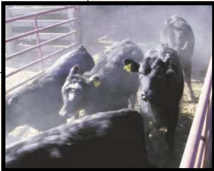
Calves must bear special alliance ear tags with individual identification numbers on the front and producer codes on the back.