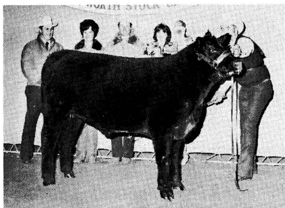
Reserve Grand Champion Angus Heifer at the 1979 Southwestern Exposition and Fat Stock Show in Fort Worth, Texas, was this entry of Double HH Farms, Adair, Illinois, and Great Plains Western, Panama, Oklahoma. The heifer is Double HH Katty Lanar, the Intermediate Champion.