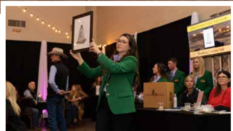
The live auction helped raise a large portion of the total funds for the evening.