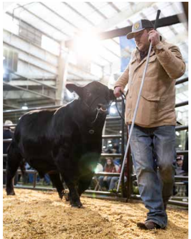
Angus breeders brought 34 bulls to the National Angus Bull Sale hosted in Oklahoma City, Okla.