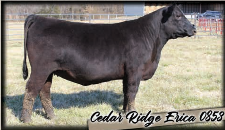
Cedar Ridge Erica 0858

Offering 12 Bred Heifers, 4 Fall Pair Splits, 8 Bulls