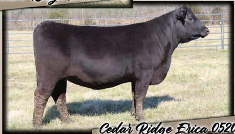
Cedar Ridge Erica 0520

Selling one-half interest in your choice between Cedar Ridge Erica 0853 and Cedar Ridge Erica 0520.