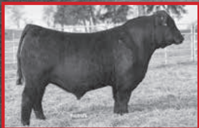
DBL Homeraised 160

Selling 110 Fall & Spring Angus Bulls a select group of Reg. Yearling Heifers