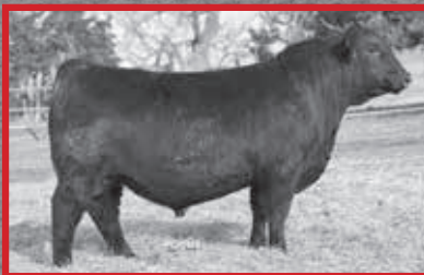
DBL Southern Charm 104