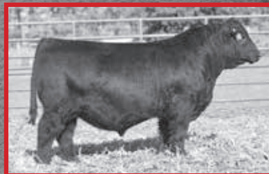
SA Power Play 127