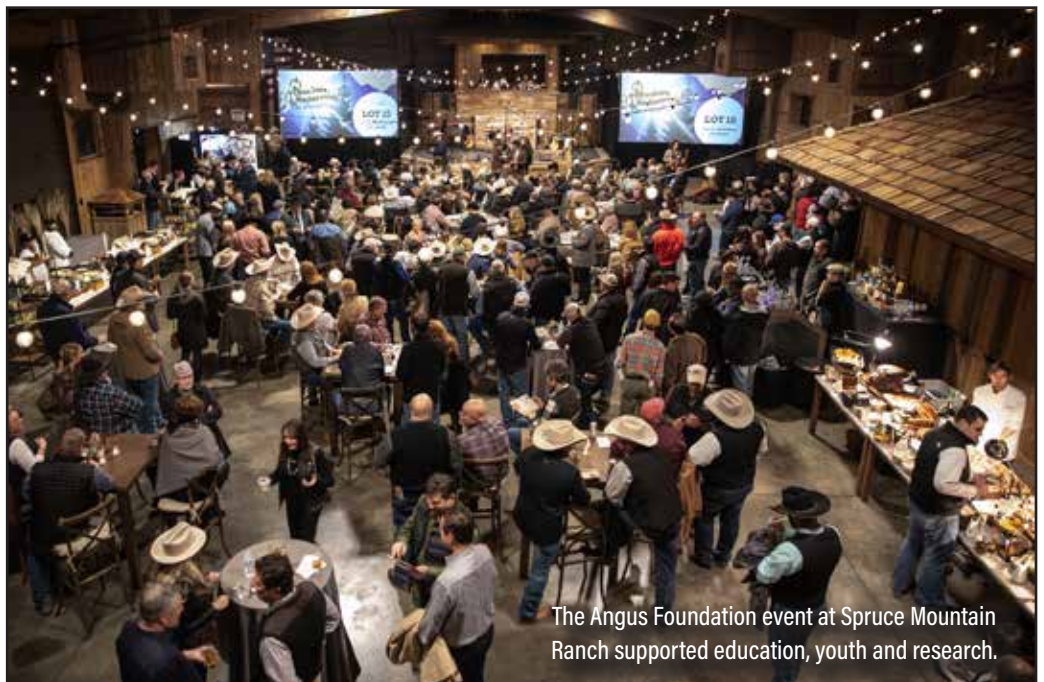
The Angus Foundation event at Spruce Mountain Ranch supported education, youth and research.