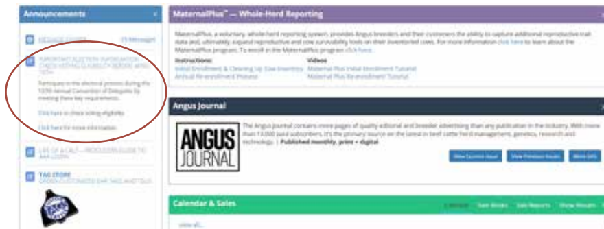
Figure 1: Check voting eligibility through AAA Login

If you have any questions regarding eligibility status, contact