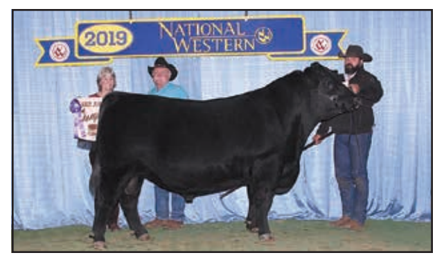
Early junior champion SSR Discovery 2527, by Sugar Springs Ranch, Lincoln, Ark.