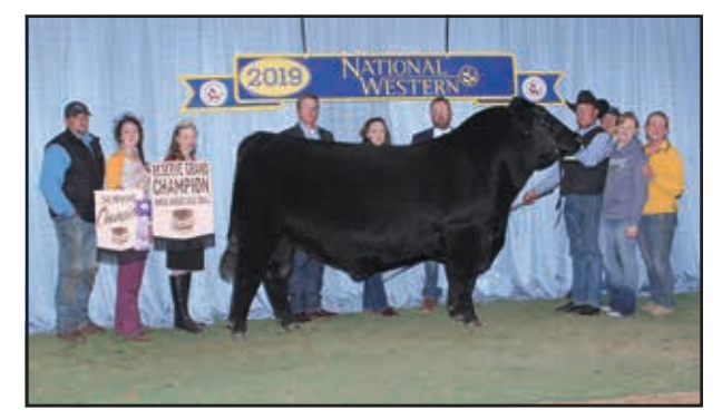
Reserve grand champion bull DAJS AH Explorer 308