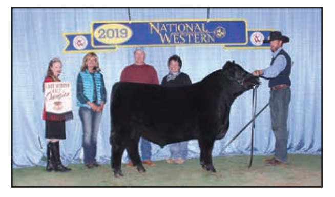
Late winter calf champion Lakeview Confidence Plus, by Lake View Angus, Mead, Colo.