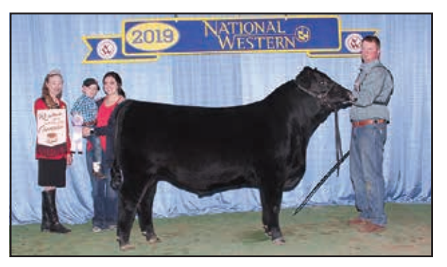
Reserve early winter calf champion Schroeder Reno 6986, by Schroeder Angus, Clarence, Iowa