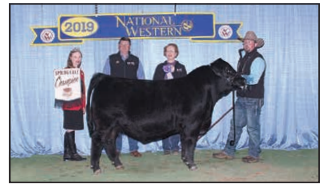
Spring calf champion Dandy Acres Dually 35, by Dandy Acres, Pipestone, Minn.