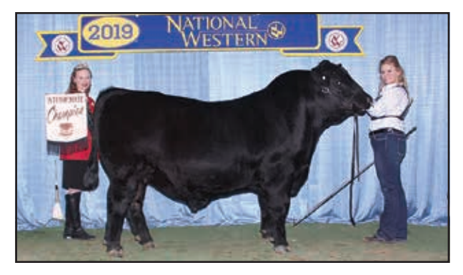
Intermediate champion Marda General MacArthur 7158, by Marda Angus Farm