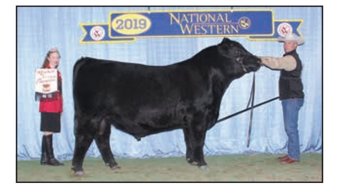
Reserve late junior champion K Bar D In Depth 23E, by K Bar D, Redmond, Ore.