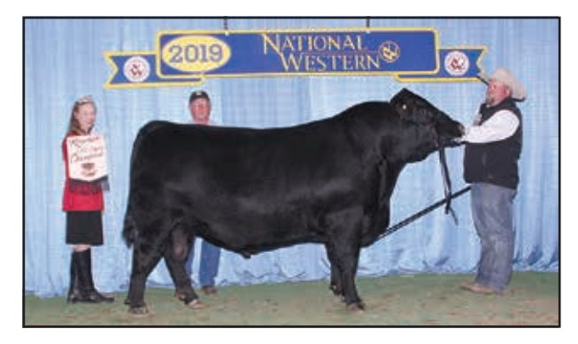
Reserve early junior champion Roseda Discovery E017, by Roseda Farm, Monkton, Md.