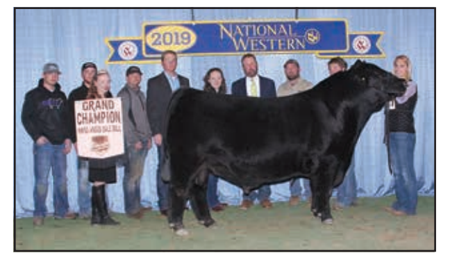
Grand champion bull WAF Collusion 703