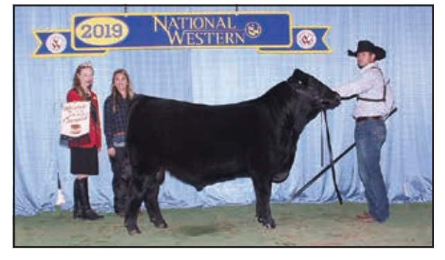
Reserve late winter calf champion LVS Sky High 1806, by Levisay Farms, Creston, Calif.