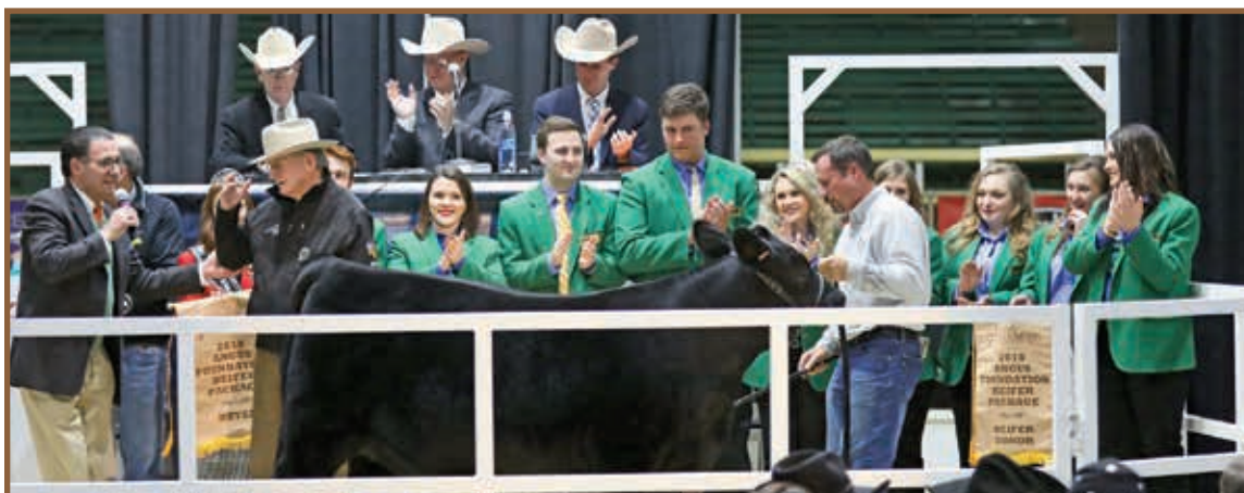
Members of the National Junior Angus Board presented this year’s Foundation Heifer before the start of the National Angus Bull Sale.