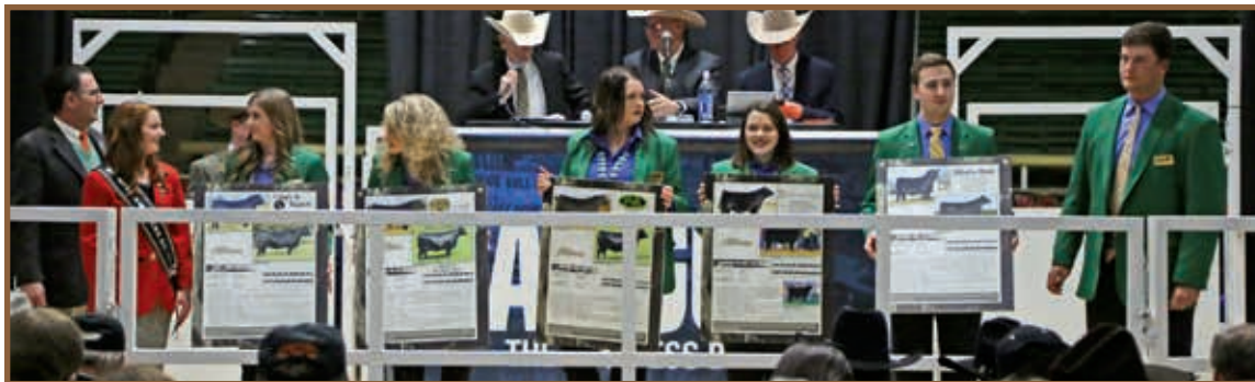
Five heifer pregnancies from notable Angus breeders also were auctioned during the National Western Angus Bull Sale, raising an additional $63,000 to benefit the Angus Foundation.

transportation to their ranch provided by Lathrop Livestock Transportation, Dundee, Ill.; and an advanced reproductive technology package from Trans Ova Genetics and its cloning division, ViaGen, Sioux Center, Iowa.