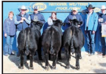
Reserve late calf champion pen of three by Bobcat Angus, Shelby, Mont. The Feb.-March 2017 bulls sired by Basin Payweight 1682, HF Powder Keg 71C and Musgrave Big Sky averaged 1,222 lb.