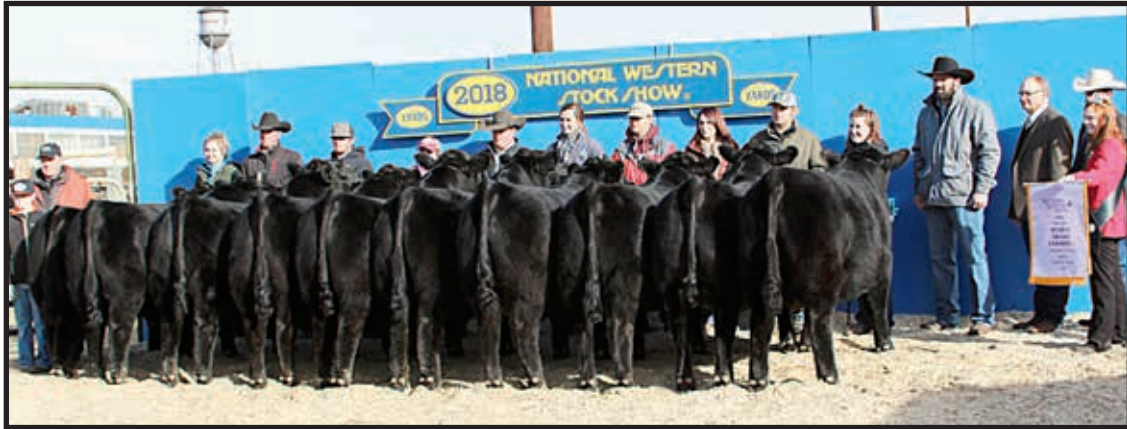
Reserve grand champion carload by Krebs Ranch