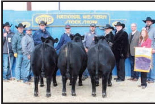
Grand champion pen of three bulls by Express Angus Ranches