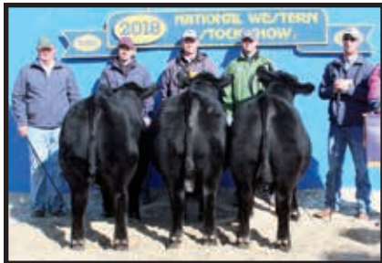
Late calf champion pen of three by Reid Angus Ranch, Akron, Colo. The Feb.-March 2017 bulls sired by Styles Cash R400 averaged 1,228 lb.