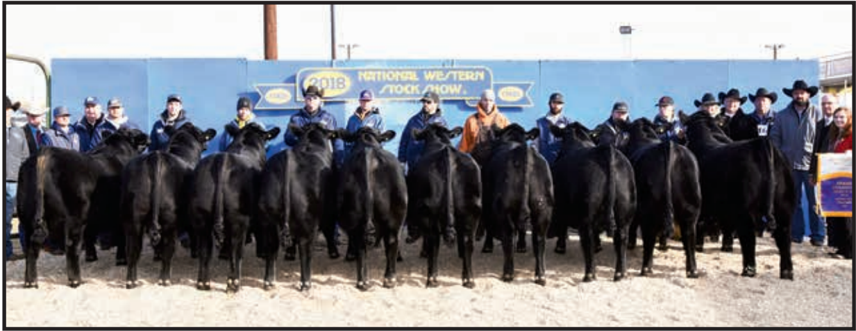
Grand champion carload by Express Angus Ranches