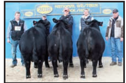
Champion yearling pen of three by Schroeder Angus, Clarence, Iowa. The Oct. 2016 bulls sired by KR Cash 4403 averaged 1,620 lb.