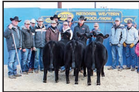
Reserve grand champion pen of three females by McCurry Angus Ranch