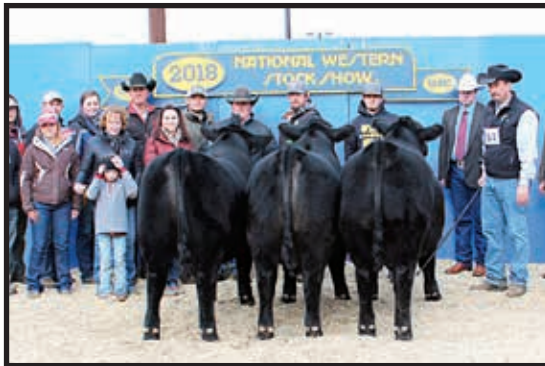
Reserve grand champion pen of three bulls by Krebs Ranch