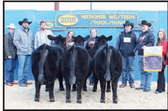
Grand champion pen of three females by Oklahoma State University