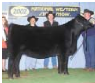
► Reserve senior calf champion, Sunset Valley Skymere 037 , by Rolling RRR Ranch LLC, Edmond, Okla. She's a Sept. 2000 daughter of SAF 598 Bando 5175.