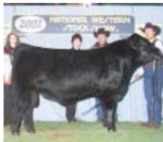
► Reserve senior calf champion, Sedgwick's Vancer 2640 , by McCurry Bros., Sedgwick, Kan. He's an Oct. 2000 son of Sedgwick's 1483 6335.