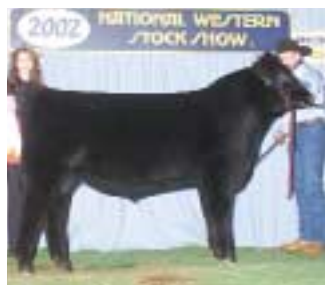
► Reserve spring calf champion, BT Venture 667L , by Beartooth Ranch, Columbus, Mont. He's a March 2001 son of R&R Venture 702.