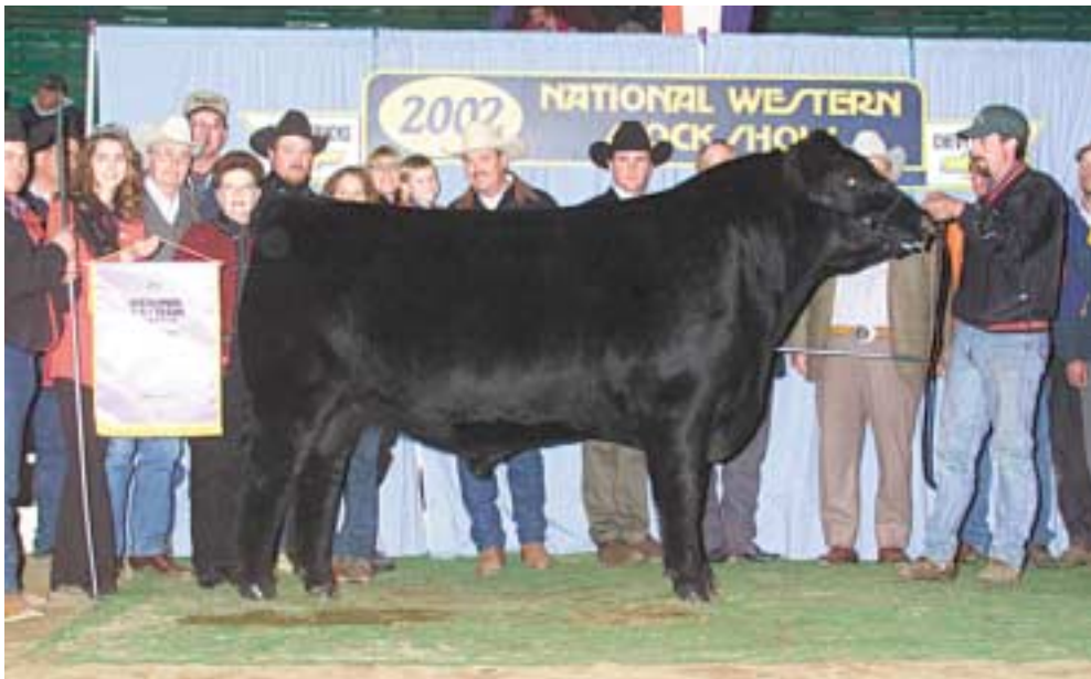
► Reserve grand and junior champion bull, Triple E Special Addition , by Whitestone-Krebs, Gordon, Neb.; and Triple E Angus, Valleyford, Wash. He's a March 2000 son of JR Something Special.