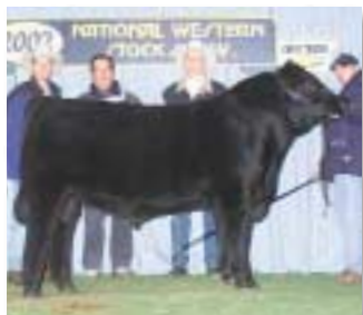
► Senior calf champion, EXAR Improvement 0913 , by Express Angus Ranches, Shawnee, Okla. He's a Nov. 2000 son of Northern Improvement 4480 GF.