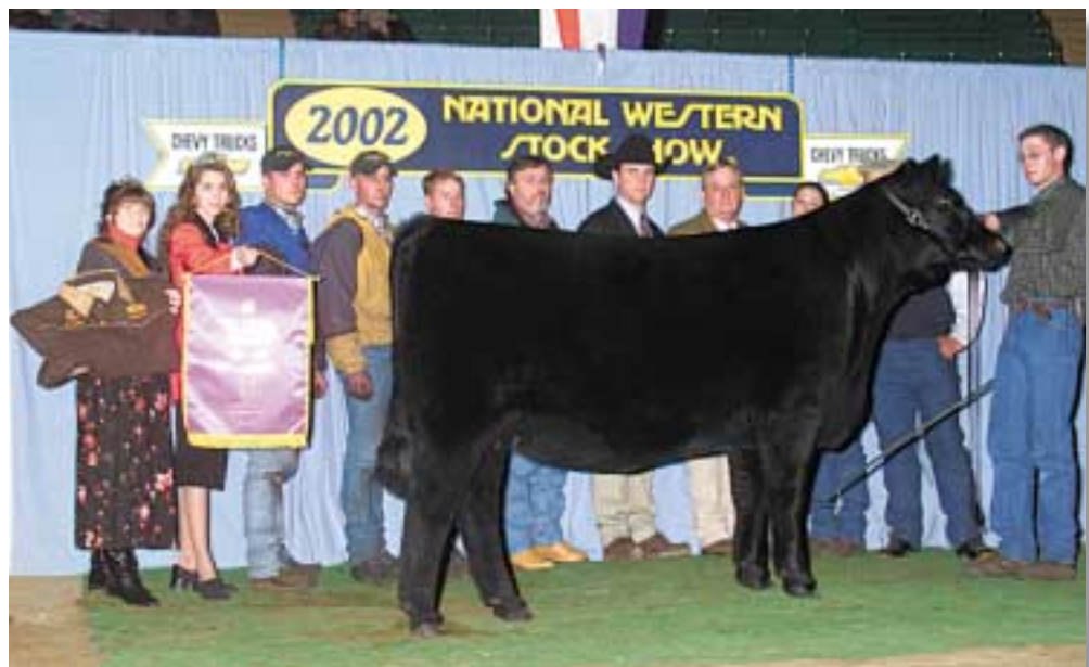
► Grand and intermediate champion female, Champion Hill Georgina 2121 , by Champion Hill, Bidwell, Ohio; and Dobson Pulpwood Farm, Campiti, La. She's a July 2000 daughter of SAF 598 Bando 5175.