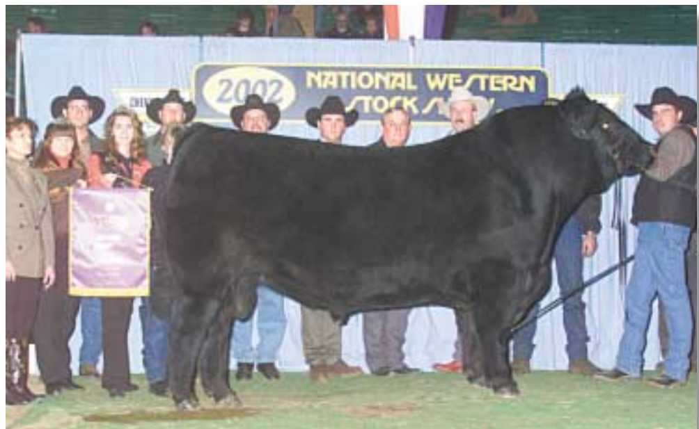
► Grand and senior champion bull, FAR Krugerrand 410H , by Frey Angus Ranch, Granville, N.D.; B&B Bruner Bros., Drake, N.D.; and Roth Angus, Freeman, S.D. He's a Jan. 1999 son of Krugerrand of Donamere 490.

The winning get-of-sire and the winning junior get-of-sire were sired by Leachman Saugahatchee 3000C. Champion Hill, Bidwell, Ohio, exhibited both groups. The winning breeder's-best-six-head entry was also shown by Champion Hill, Bidwell, Ohio.