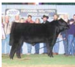
► Winter calf champion, EXAR Sudden Impact 1537 , by Rolling RRR Ranch LLC, Edmond, Okla.; Express Angus Ranches, Shawnee, Okla.; and Monarch Farm, Folsom, La. He's a Jan. 2001 son of Northern Improvement 4480 GF.