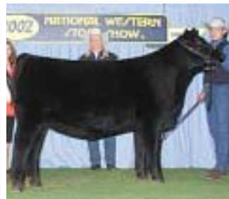
► Reserve intermediate champion, BAAR Wendy 051 , by EXLR, Yukon, Okla.; and Dynasty Farms Inc., Langley, British Columbia, Canada. She's an Aug. 2000 daughter of GDAR SVF Russ 184B.