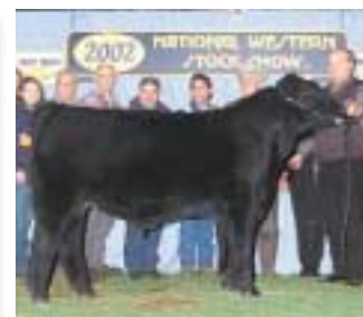
► Reserve winter calf champion, Dameron PVF Liberty 104 , by Weaver Angus Farm, Peoria, Ill.; Dameron Angus Farm, Lexington, Ill.; and Prairie View Farm, Gridley, Ill. He's a Jan. 2001 son of Leachman Saughatchee 3000C.