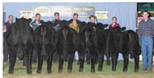
► Champion Hill , Bidwell, Ohio, exhibited the winning breeder's best six head.