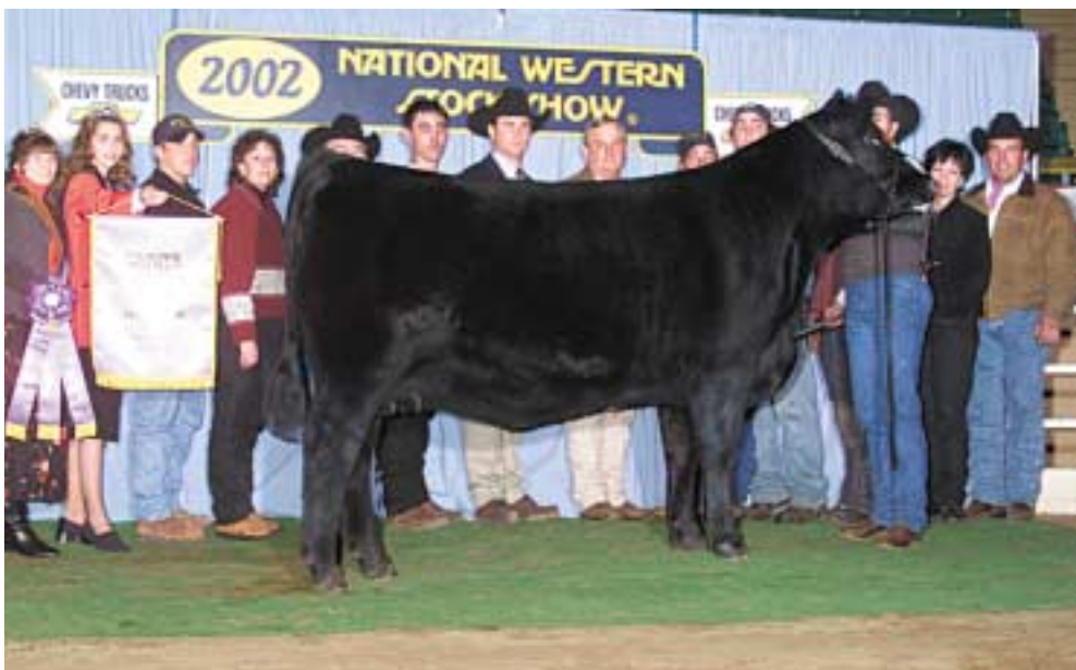
► Reserve grand champion female, Sedgwick's Lass 5810 , by Casey Blew, Mount Hope, Kan. She's a Feb. 2000 daughter of McCumber 124 Traveler 212.