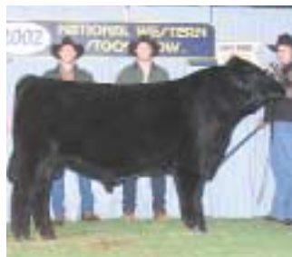
► Intermediate champion, Roth Famous 0289 , by Roth Angus, Freeman, S.D. He's an Aug. 2000 son of Famous 7001.