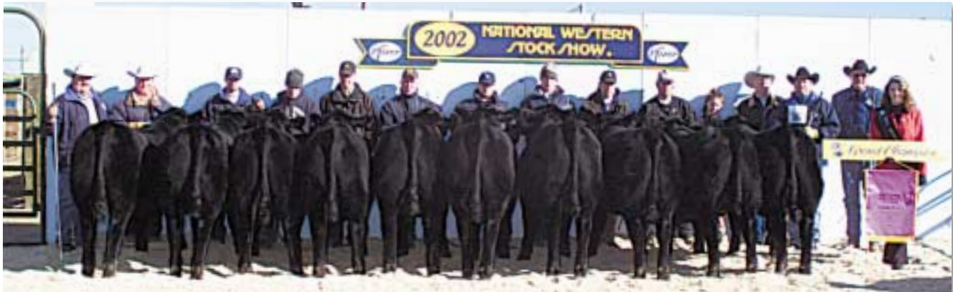
Grand champion carload ► Express Angus Ranches, Shawnee, Okla.

A&B Cattle, Bassett, Neb., claimed the reserve grand champion pen banner with their March 2001 bulls by A&B Yukon 7150 and Krugerrand of Donamere 490. The bulls first won late calf champion pen of three. They averaged 0.48 in. rump fat, 0.38 in. rib fat, 34.17 cm scrotal circumference and 1,152 lb. body weight.