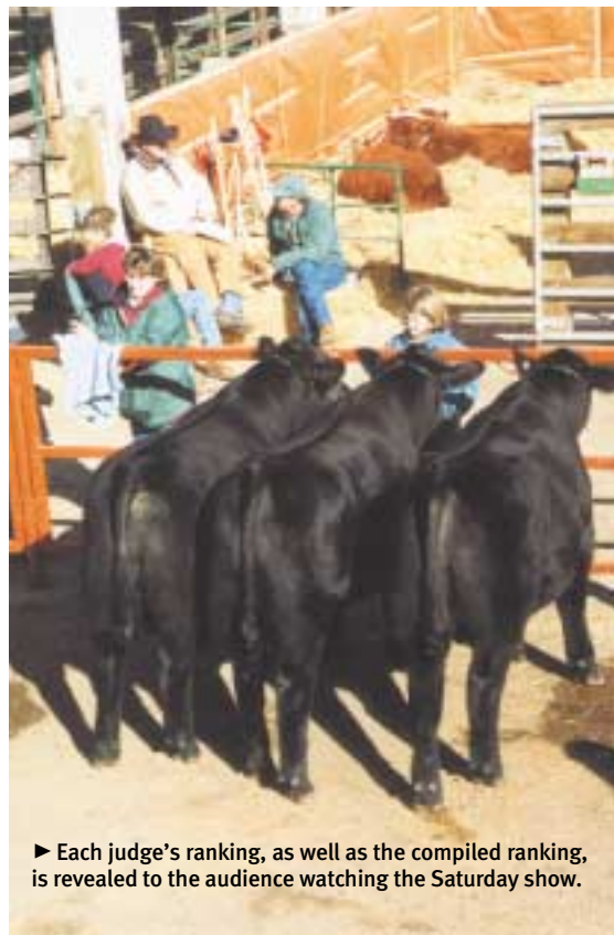
► Each judge's ranking, as well as the compiled ranking, is revealed to the audience watching the Saturday show.