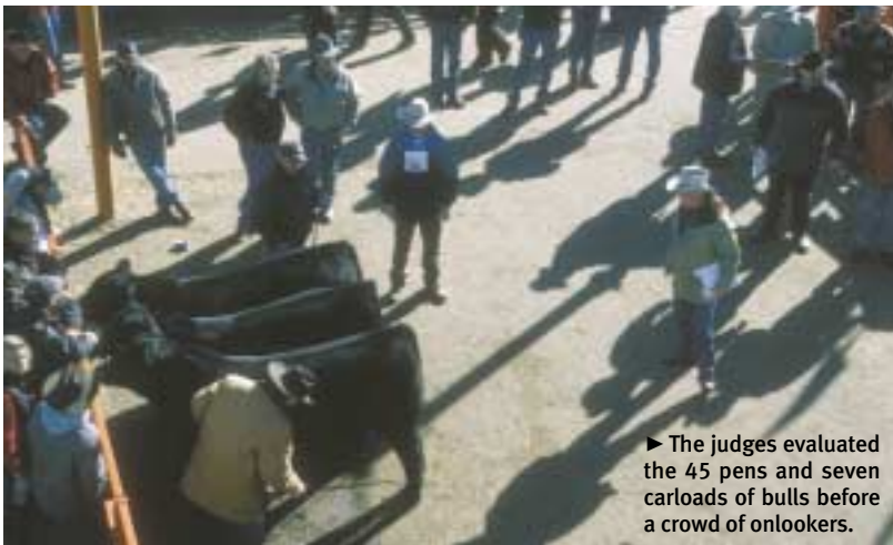
► The judges evaluated the 45 pens and seven carloads of bulls before a crowd of onlookers.