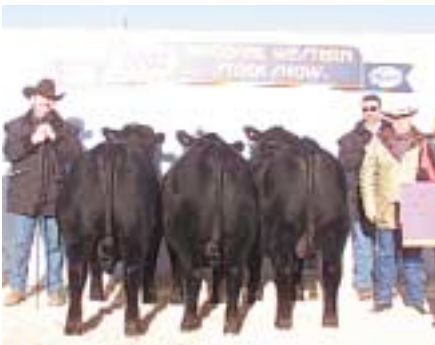
Champion yearling pen ► Circle A Ranch, Iberia, Mo.