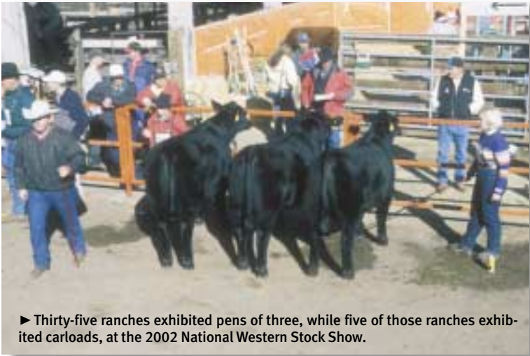
► Thirty-five ranches exhibited pens of three, while five of those ranches exhibited carloads, at the 2002 National Western Stock Show.