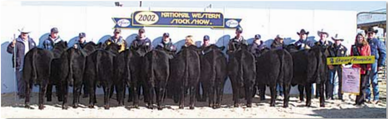
Reserve grand champion carload ► Express Angus Ranches, Shawnee, Okla.