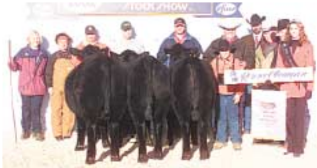
Reserve grand champion and late calf champion pen ► A&B Cattle, Bassett, Neb.