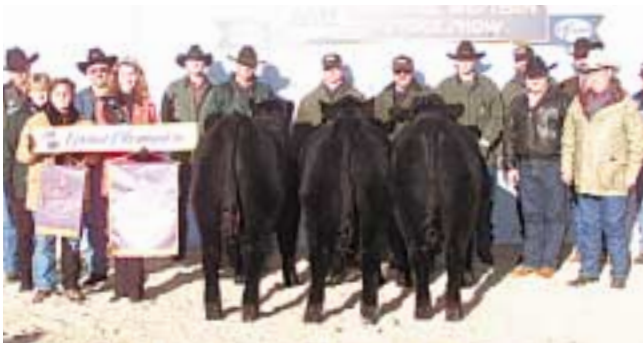
Grand champion and early calf champion pen ► Roth Angus, Freeman, S.D.