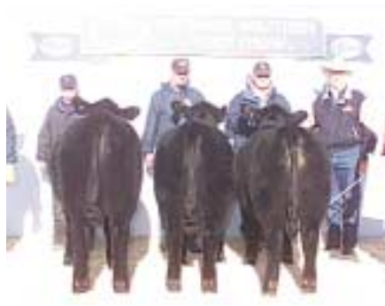
Reserve early calf champion pen ► Express Angus Ranches, Shawnee, Okla.