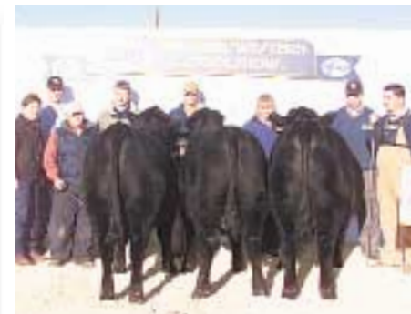
Reserve champion yearling pen ► Oklahoma State University, Stillwater, Okla.