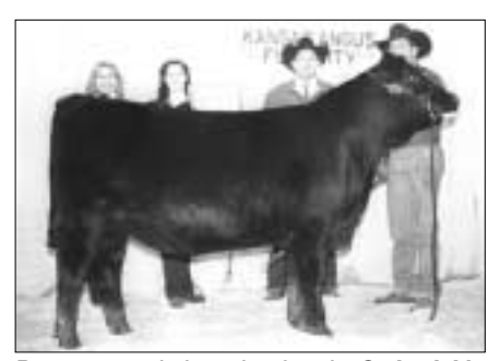
Reserve grand champion female, Sedgwick's Lass 3109 , by McCurry Bros., Sedgwick. She's a Sept. 1999 daughter of McCumber 124 Traveler 212.