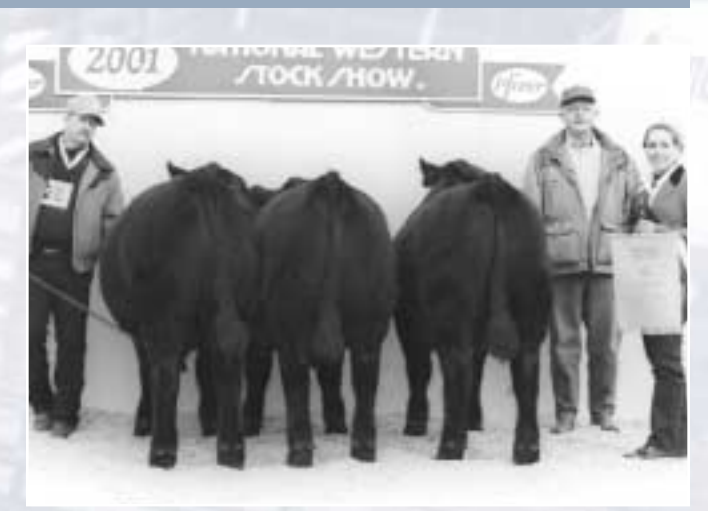
Reserve late calf champion pen Quirk Land & Cattle Co., Hastings, Neb.