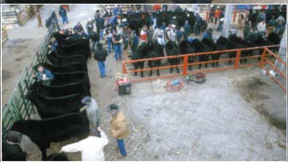
Producers exhibited 46 pens and six carloads of Angus bulls at the 2001 NWSS Angus Pen and Carload Show, Jan. 13 in Denver, Colo.