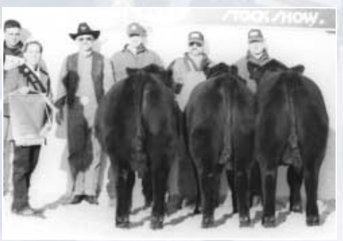
Champion yearling pen Roth Angus, Freeman, S.D.