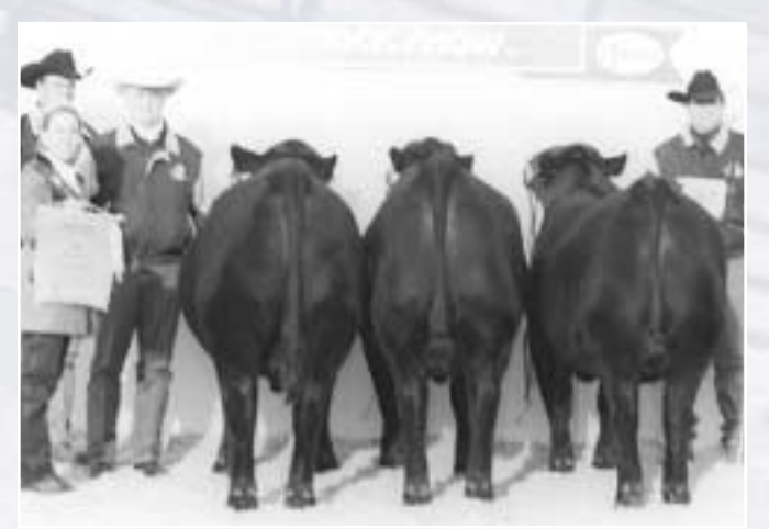
Reserve champion yearling pen Express Angus Ranch, Yukon, Okla.