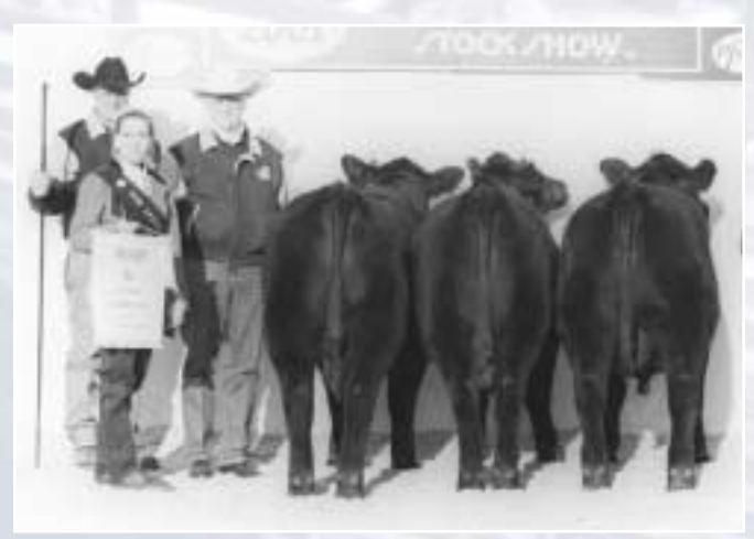
Reserve early calf champion pen Express Angus Ranch, Yukon, Okla.