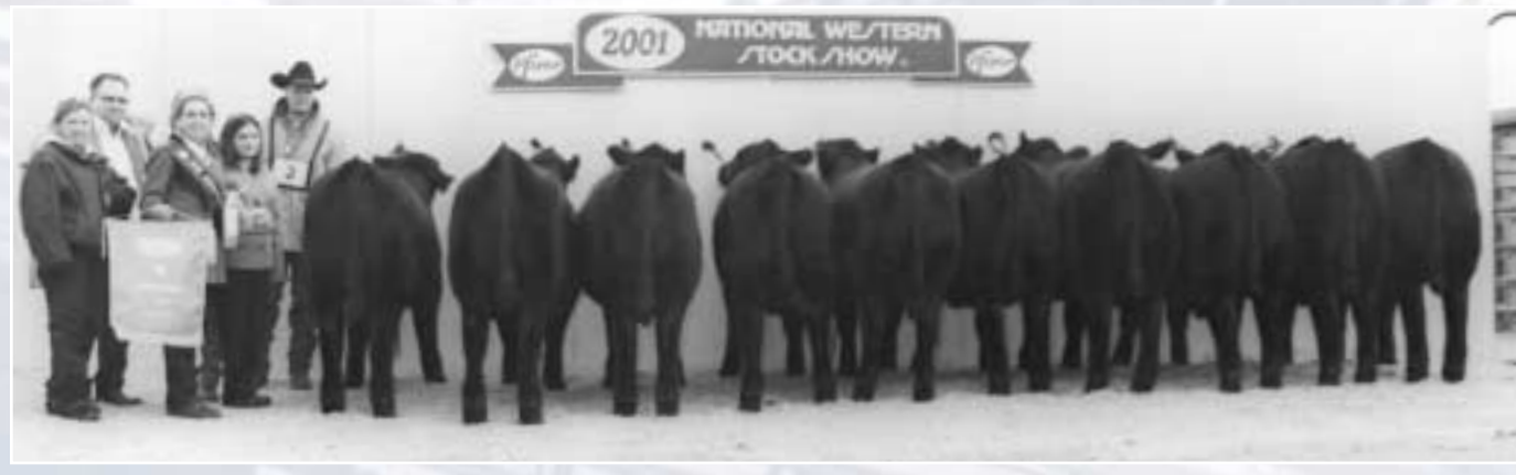
Grand champion carload Whitestone-Krebs, Gordon, Neb.

GRAND CARLOAD: Entry 2, by Whitestone-Krebs, Gordon, Neb.