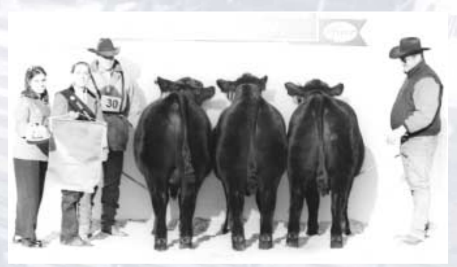
Grand champion pen Whitestone-Krebs, Gordon, Neb.

Entry 61, Pen #1505; sired by LF New Trend 4100; by Mill Creek Ranch/Pied Piper Farms, Alma, Kan.