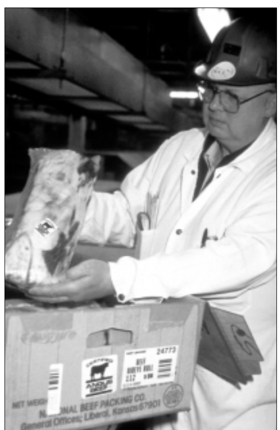
When group members were asked their predictions of how much product would be branded by 2005, answers ranged from just less than 20% to just less than 50%.

interest in getting up a pilot project in the upper Midwest during 1999," Johnson said. The proposal includes "Retail Consumption Regions" that divide the United States into the West, North Central, South Central, Southeast and Northeast.