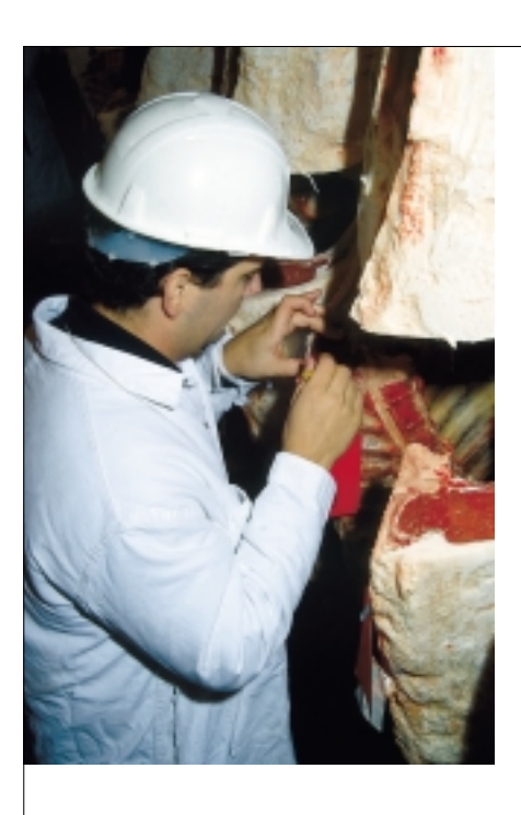
Summit group members suggested human grading must be augmented with calibrated instrument grading such as Video Image Analysis (VIA).

There is a great need for broadening the database, however, Johnson pointed out. At retail, beef makes up 40% of meat sales, with the meat counter making up 18% of store sales, on average. The Computer Assisted