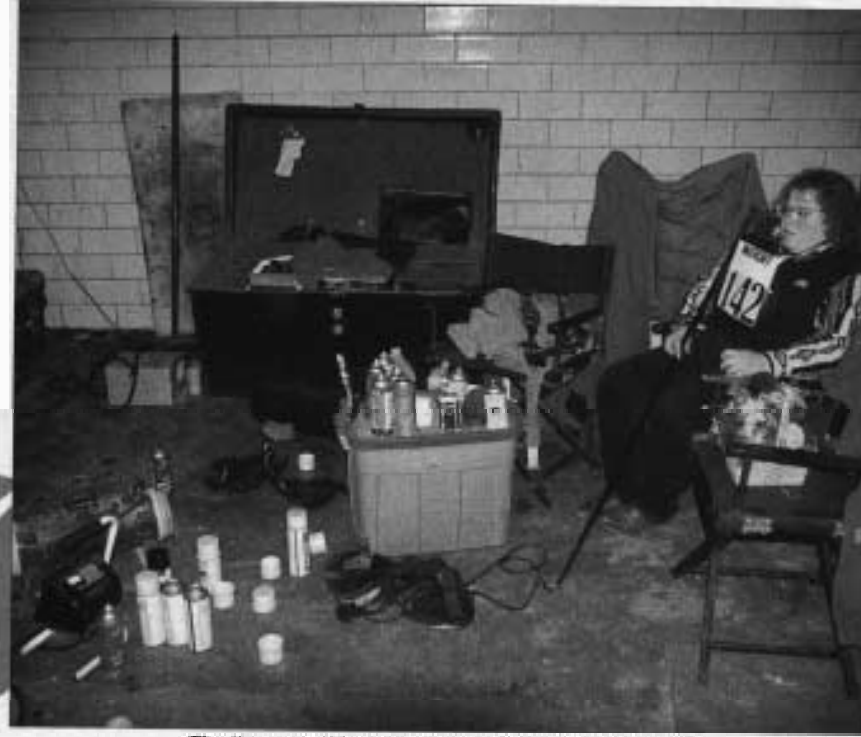
The "cow stuff" takes up more room than the cows.