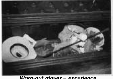
Worn-out gloves = experience