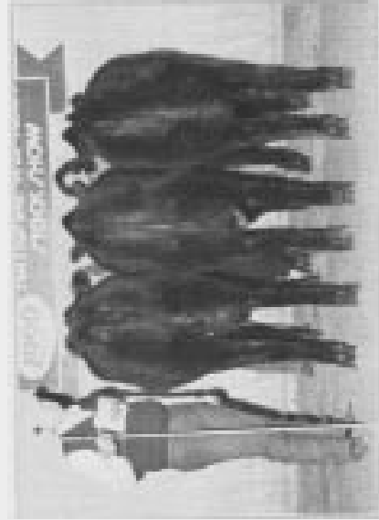
RCV Junior Get-of-Sire champion, Northcoke Excitement progeny, by Northcoke Angus Farm.