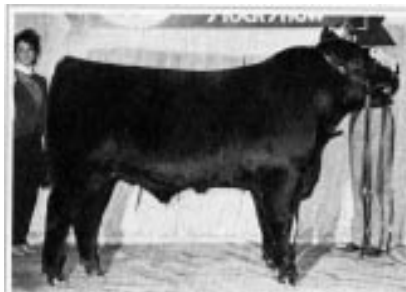
Sale bull show intermediate champion GF Linedrive 863.