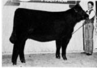
ROV Junior heifer reserve champion Jestrees Gal 802.