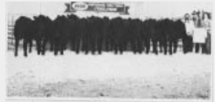
Reserve grand champion carload Whitestone-Krebs.