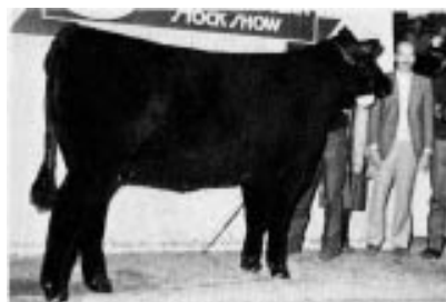
ROV senior female reserve champion Northcote Unique World.