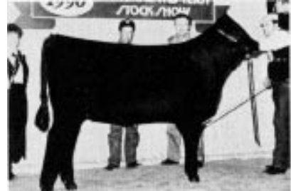
ROV senior heifer calf reserve champion Northcote Exciting Erica.