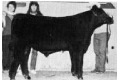
Sale bull show junior calf champion 4S Blackstone 4249.