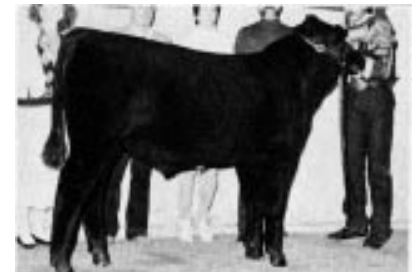
ROV spring bull calf reserve champion Bradys Hillsboro 951.