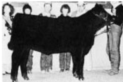
ROV winter heifer calf reserve champion Kesslers Patricia.