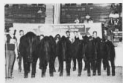
ROV Best Six Head champion Northcote Angus Farm, Forest, Va.