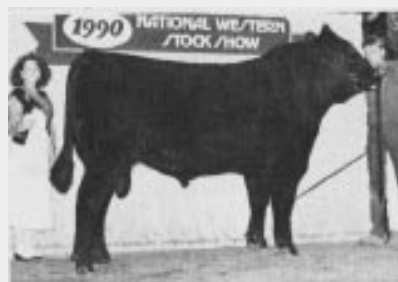
ROV senior bull reserve champion Manhattan of Indian Creek.