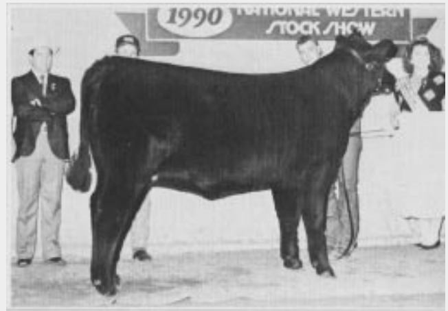
ROV reserve grand and reserve intermediate champion female HA Tonya.