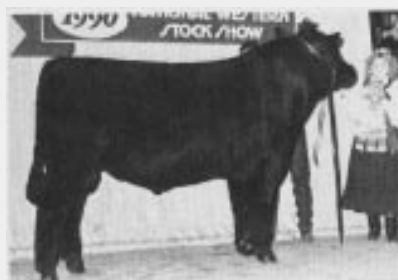
ROV intermediate bull champion Hilmes Linebacker of 1806.