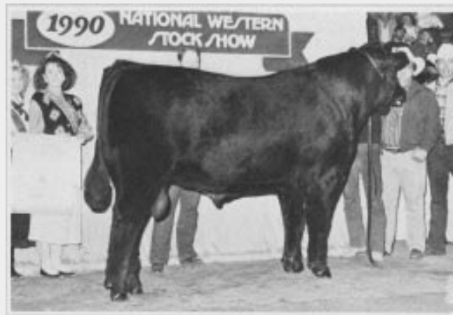
ROV reserve grand and junior champion bull Elmdales Top Flight 428.