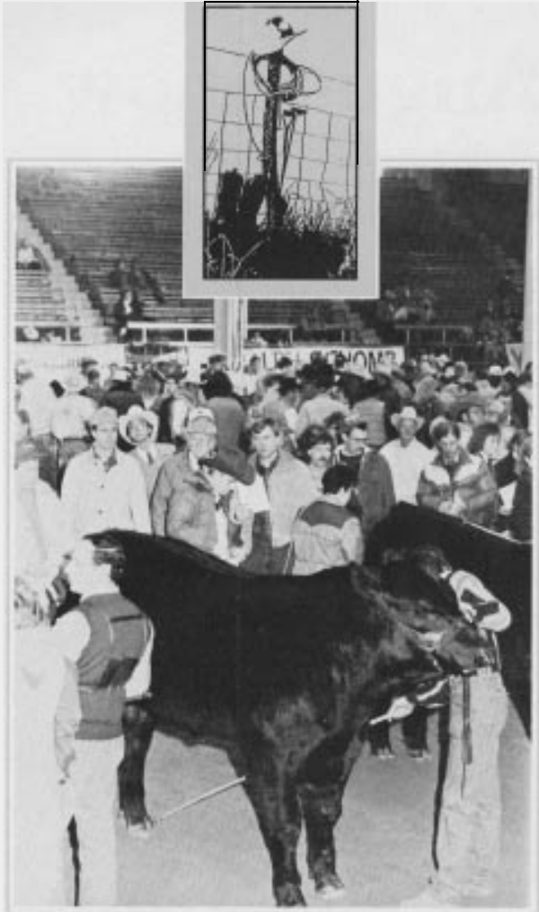
Interested buyers get a closer look at Angus bulls before the 1990 National Western Stock Show Sale. A total of 29 Lots sold this year at an average price of $6,150.