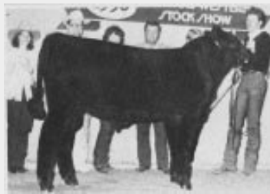
ROV winter bull calf reserve champion WK Replay.