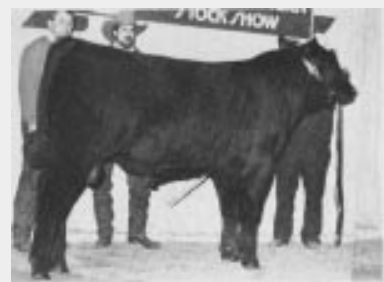
ROV senior bull calf champion Cedarcrest Rhodes Scholar.