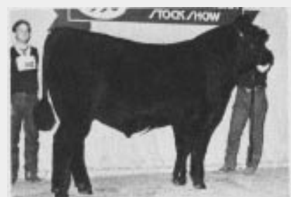
ROV intermediate bull reserve champion HBW Winfield.