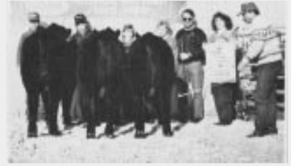
Reserve grand champion pen of three Erdmann Angus Ranch.