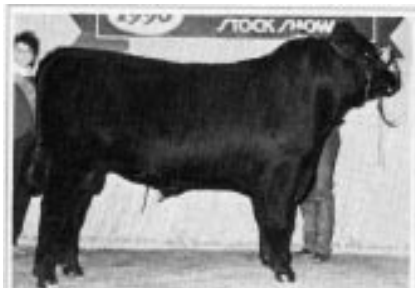
Sale bull show junior champion Woodstone Brodie 8009.