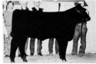
ROV winter heifer calf champion Fairfield Jesseca J19.

SENIOR Annalea Marchesa, by Fox Hill Farm & Annalea Farms Ltd.