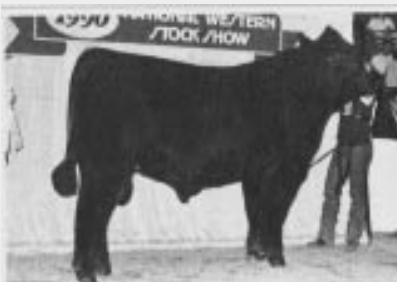
ROV junior bull reserve champion FF Starstruck.