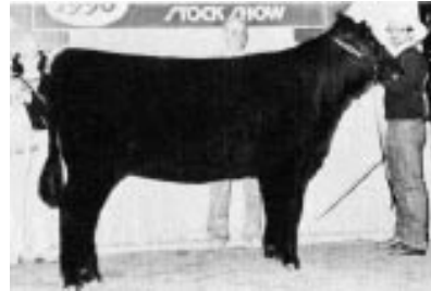
ROV senior heifer calf champion Kiata Jeanne.