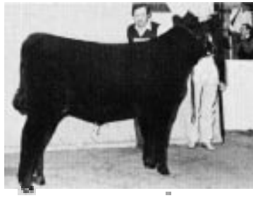
ROV spring heifer calf reserve champion Blackcap Kenzie of G U