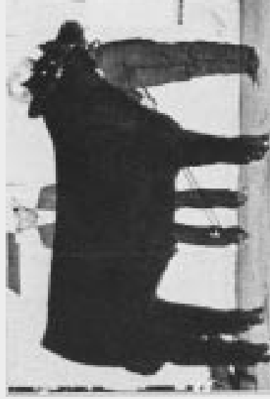
This 1,295-pound Angus crossbred steer earned reserve grand champion market steer for Sheffield Wise of Brownwood, Texas.