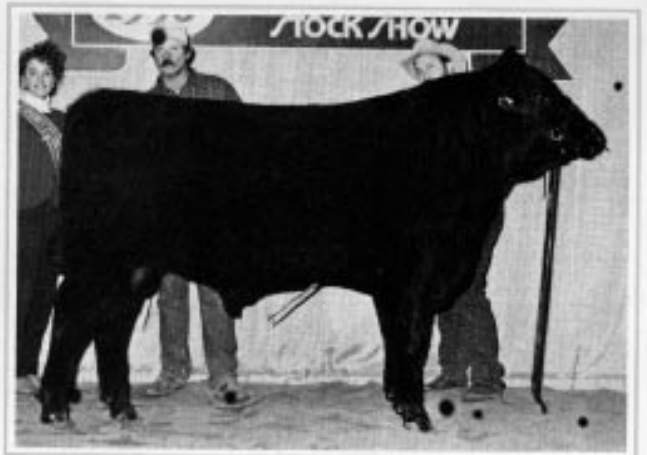
Reserve grand champion sale bull, Bipperts Galter.