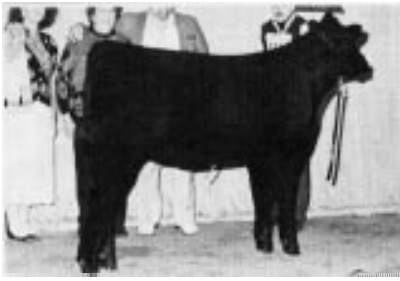
ROV spring heifer calf champion Springfield Angela 9208.