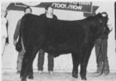
ROV senior bull calf reserve champion WB Northward.