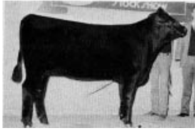
ROV intermediate heifer reserve champion BLC Queen Jessica of Vintage.