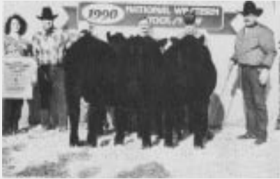
Grand champion pen of three Frey Angus Ranch.