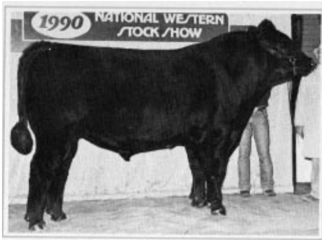
Grand champion sale bull, Ankonian Asteroid.