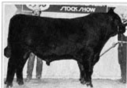
Sale bull show reserve senior champion Bipperts Stingray 697.