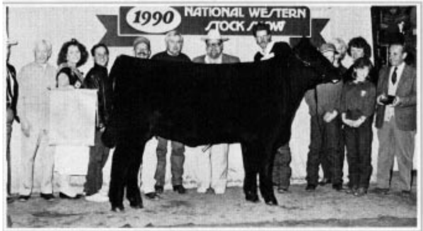
ROV grand and intermediate champion female, Magnum Unique 2.