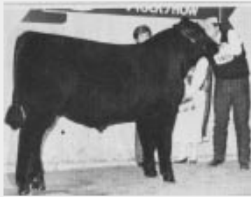
ROV winter bull calf champion Northcote Excellence.