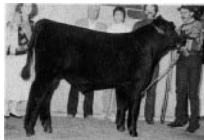
ROV spring bull calf champion Bradys Express 944.