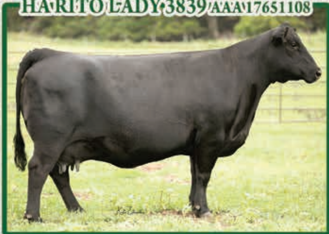
HA RITO LADY 3839 AAA 17651108

CED BW WW YW Milk RE Marb $B $C +9 +.9 +73 +134 +28 +61 +70 +167 +300