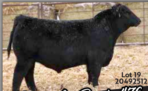
Bushes In Route 476

1/20/22 Bw 78 • Weaning Wt. 765 • Ratio 101 Sire: Bushes Wing Man 201 • MGS: Next Step 2036 BW +0.5, WW +66, YW +119, Milk +19