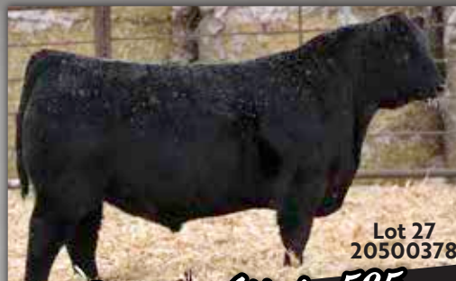
Bushes Attain 535

2/09/22 BW 92 • Weaning Wt. 859 • Ratio 113 Sire: Evenson Everest 964 • MGS: Bushes Untouchable 622 BW +1.1, WW +80, YW +136, Milk +24