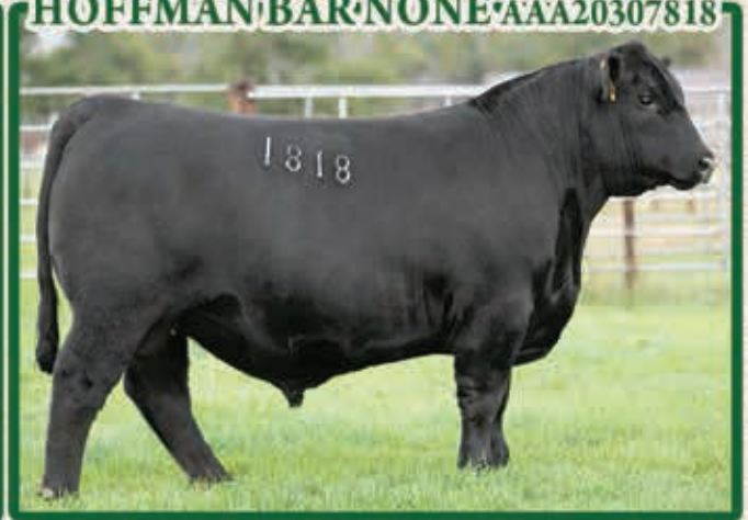
HOFFMAN BAR NONE AAA 20307818

CED BW WW YW Milk RE Marb $B $C +10 +.8 +91 +161 +31 +62 +50 +161 +312