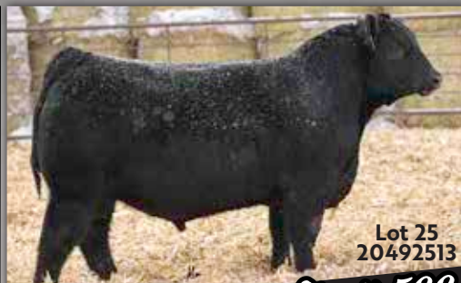
Bushes Up the Limit 533

2/09/22 BW 92 • Weaning Wt. 859 • Ratio 113 Sire: Evenson Everest 964 • MGS: Bushes Untouchable 622 BW +1.1, WW +80, YW +136, Milk +24