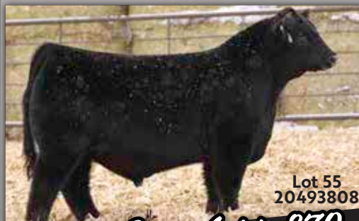
Bushes Step Aside 870

2/10/22 Bw 88 • Weaning Wt. 865 • Ratio 114 Sire: Evenson Everest 964 • MGS: Bushes Double Time 879 BW +0.7, WW +76, YW +137, Milk +37