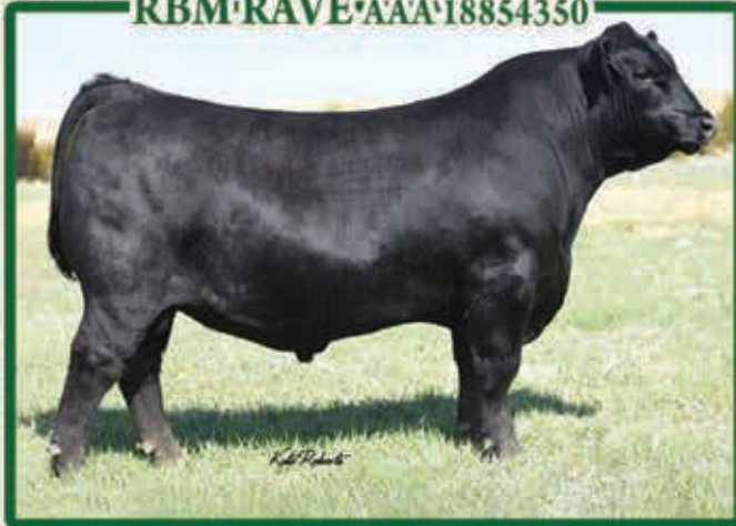
RBM RAVE AAA 18854350

CED BW WW YW Milk RE Marb $B $C +11 -.8 +78 +148 +27 +43 +40 +169 +252