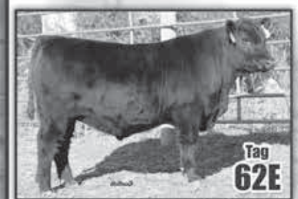
Diamond In Rough Son Big spread from Birth to YW sire!!

Selling: 100 Angus Bulls - Including 40 E.T. Bulls 40 Heifers - High maternal cow makers