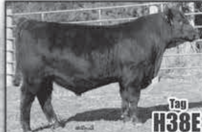
Harvestor Son 12 Flush Brothers sell