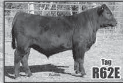
Responder Son Calving ease, growth & maternal sire