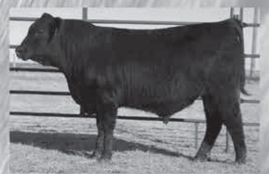
EF Exodus E10

RB Tour of Duty 177 X Frenzen Future W185 CED+9 BW+0.7 WW+69 YW+119 M+28 $B+143.65