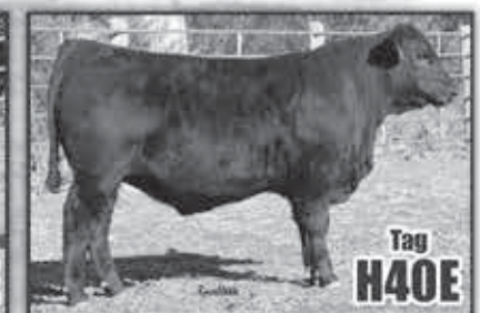
Harvestor Son 12 Flush Brothers sell