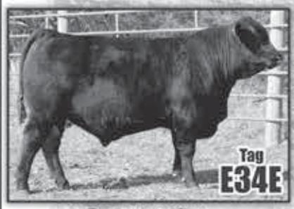
Resource Son Capacity & growth at its best!