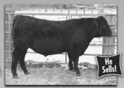
PC Big Easy 545 AAA 18784581 HFA Big Easy L418 x Connealy Substance 9283