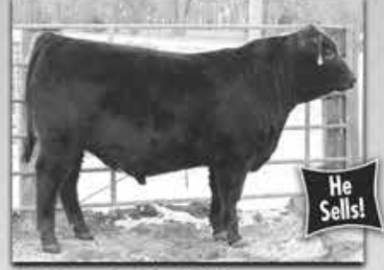
PC Southside 340 AAA 18784598 K C F Bennett Southside x TC Foreman 016