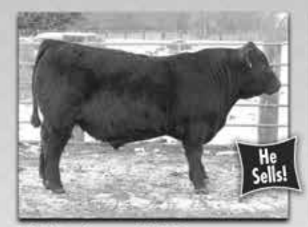
PC Territory 1180 AAA 18790100 Baldridge Territory Z068 x Connealy Thunder 4424