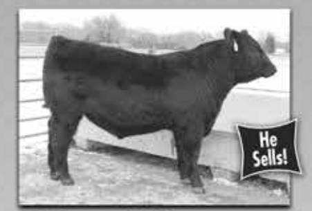
PC Diamond 520 AAA 18751479 Diamond in the Rough x Connealy Packer 547