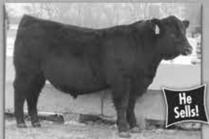
PC Big Easy 1076 AAA 18784606 HFA Big Easy L41B x ALC Tracker LO6T