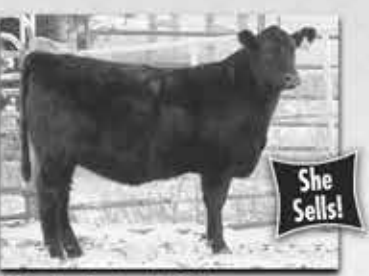
PC Acclaim 738 AAA 18790235 Jindra Acclaim x Sitz Upward 307R