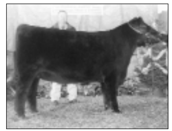
► Grand champion female, WK Tillie 1036, by Mercedes Danekas, Wilton. She's a Feb. 2001 daughter of Northern Improvement 4480 GF.