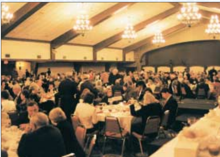
Tickets to the 1999 Annual Banquet were a treasured commodity as more than 600 Angus enthusiasts set a record for attendance.