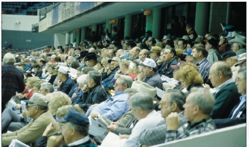
Angus enthusiasts from across the United States traveled to Louisville to participate in the American Angus Association Annual Meeting and to watch the 1999 National Angus Show.