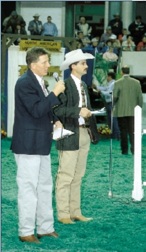
The judges evaluated more than 60 classes of Angus during the two-day event.