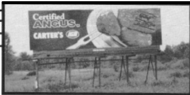
Carters Food Centers, located in central Michigan, is another retailer doing an excellent job of promoting CAB. Above is a Carters/CAB billboard located along one of the major highways in Michigan.

The CAB office would, once again, like to invite every Angus breeder to help promote our end product. Available upon request are materials to help you introduce the CAB program to restaurants or retail stores in your area. Simply call the CAB office for more information.