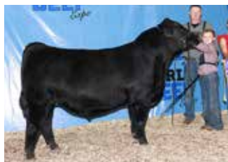
GRAND CHAMPION BULL SA Rich Spirit 219

EDITOR'S NOTE: Photos by Next Level Images, courtesy of American Angus Association.