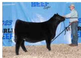
RESERVE GRAND CHAMPION FEMALE CCF Winnie 234