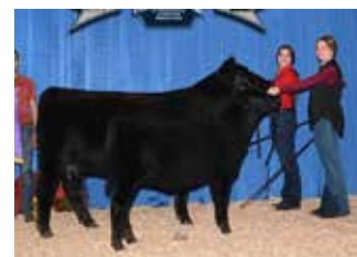
RESERVE GRAND CHAMPION COW-CALF PAIR PLR Queen Reina 9918