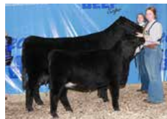
GRAND CHAMPION COW-CALF PAIR KF-Patton Proven Queen 2010