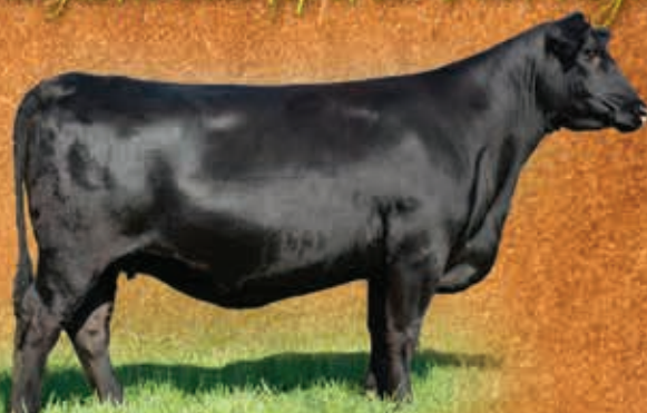
XLAR Lucy 8519 AAA • *19282907 • EMBRYOS BY EZAR SPURS UP • BA7 OAKS BOLD RULER