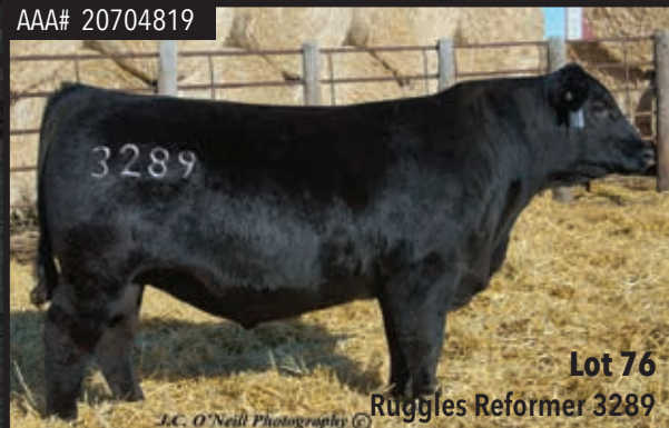
Lot 76 Ruggles Reformer 3289

CED BW WW YW Milk Marb $M $W $B $C 6 1.8 77 135 25 0.86 63 71 189 308