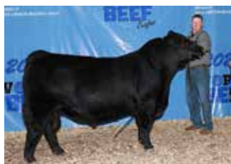
RESERVE GRAND CHAMPION BULL SA Atlantis 6975