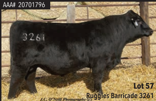
Lot 57 Ruggles Barricade 3261

CED BW WW YW Milk Marb $M $W $B $C 5 2.9 78 129 22 0.59 63 62 151 259