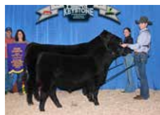
GRAND CHAMPION COW-CALF PAIR B&R Elsa's Mabel