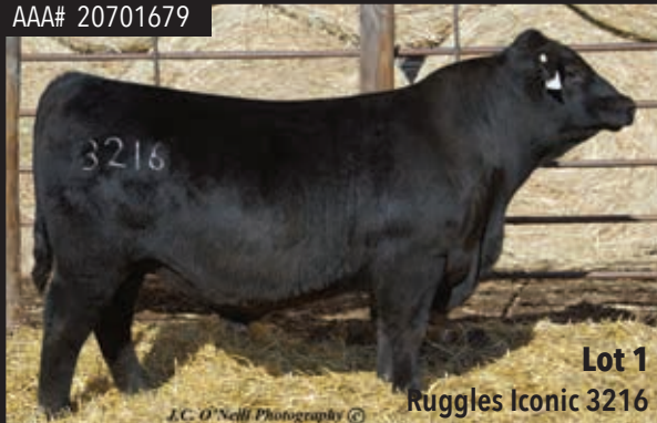
Lot 1 Ruggles Iconic 3216

CED BW WW YW Milk Marb $M $W $B $C 10 0.6 82 148 36 1.27 56 82 196 310