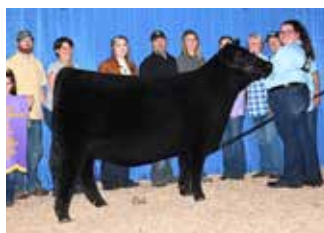
RESERVE GRAND CHAMPION FEMALE SSF Envious Blackbird 5022