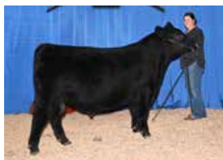
RESERVE GRAND CHAMPION BULL Circle R/Big Run Denali 2942