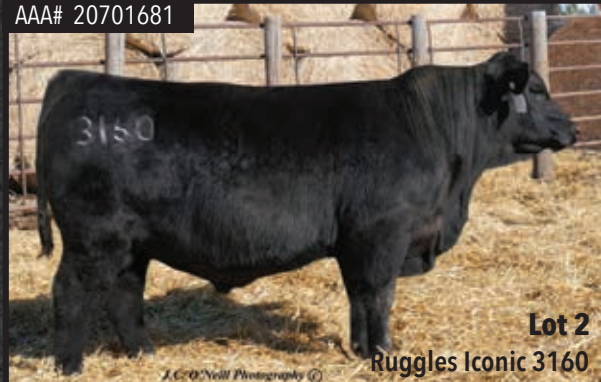
Lot 2 Ruggles Iconic 3160

CED BW WW YW Milk Marb $M $W $B $C 9 -0.1 86 147 19 0.91 86 77 178 317