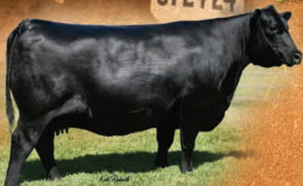
DCF Chloe 5769 AAA • *18484962 • EMBRYOS BY EZAR GETTYSBURG • HPCA VERACIOUS • BASIN JAMESON RSA BALL OF FIRE