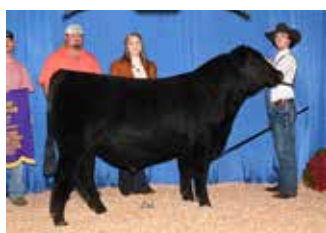
GRAND CHAMPION BULL Oakley Tonic 2265

EDITOR'S NOTE: Photos by Linde's Livestock Photography, courtesy of American Angus Association.