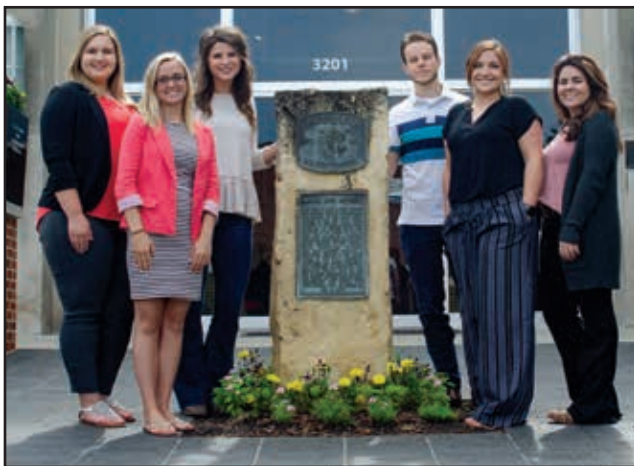
College students can grow their professional skills through American Angus Association summer internships. Pictured are the 2018 Angus summer interns.