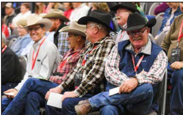
Attendees had many activities to choose from while at Angus Convention in Columbus, Ohio.

Convention attendees entered the Grand Prize Giveaway contest to win a Priefert and Tru-Test complete cattle handling system and a John Deere XUV835M