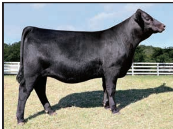
VAR Blackbird 7184

The fourth biennial Women Connected Conference will