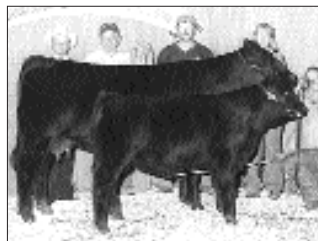
► Grand champion cow-calf pair, Keifer's Camilla , by JH Keifer Farm, Bangor, Pa. She's a May 1999 daughter of Bishard's Traveler 7492. Her calf is an April 2001 son of Millcreek Diversity.