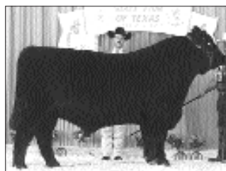
► Reserve grand champion bull, SAR Daniel 901 , by Sandhill Angus Ranch, Holly, Colo.; and Bar N L Livestock, Douglas, Wyo. He's a Jan. 1999 son of TC Stockman 365.