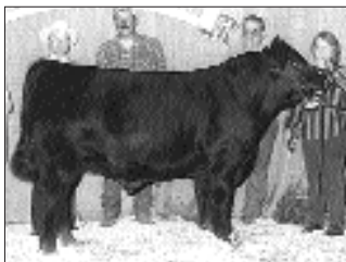
► Grand champion bull, BF Trucker 380 , by Bipperts Farms, Alden, N.Y. He's a Sept. 2000 son of Krueger's Backstretch 1104.

Judge: Calvin Drake, Manhattan, Kan. • Oct. 5