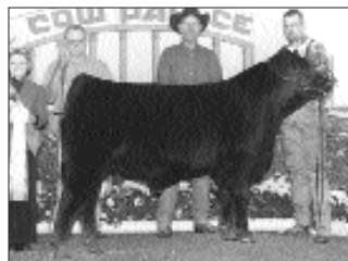
► Reserve grand champion bull, HAVE Precision H301 , by HAVE Angus, Wilton, Calif. He's a March 2001 son of Twin Valley Precision E161.