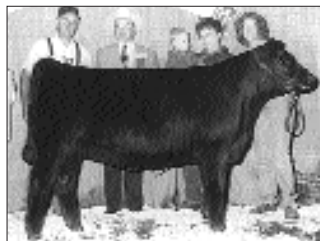
► Grand champion female, Dalton's Queen L 0217 , by Weaverland Valley Farms, New Holland, Pa. She's a Sept. 2000 daughter of PAPA Universe 515.