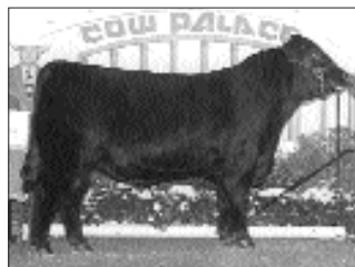
► Grand champion bull, KC Mountain Thunder , by KC Angus, La Pine, Ore. He's a March 2000 son of OGL Battle Cry 427 128.