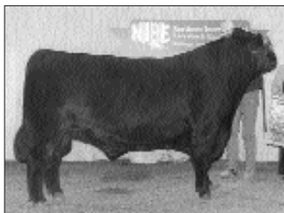
► Grand champion bull, TJ Amigo V615 , by TJ Cattle Co., Columbus, Mont., and Suburban Home Farm, Spencer, Ind. He's a Feb. 1999 son of TC Stockman 365.