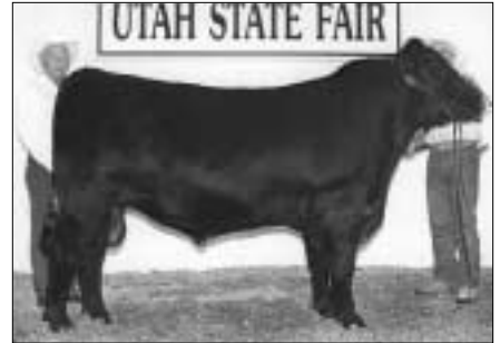
Reserve grand champion bull, Sawtooth Fix It 27J , by Sawtooth Cattle Co., Gooding, Idaho. He's a Jan. 1999 son of Schoene's Fix It 826.