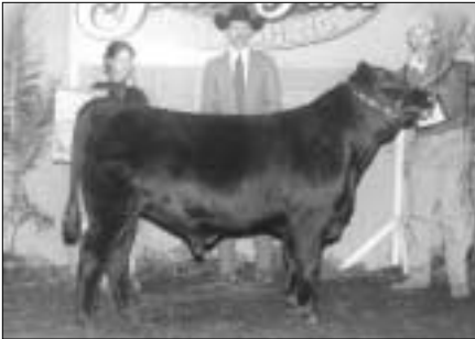
Reserve grand champion bull, Circle J New Design 0051 , by Circle J Farms, Cherryville. He's a Jan. 2000 son of B/R New Design 036.