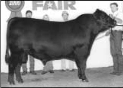
Grand champion bull, Rainbow Saugahatchee 254 , by Rainbow Angus Farms, Ashford. He's a Nov. 1998 son of Leachman Saugahatchee 3000C.