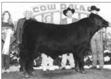
Reserve grand champion bull, 3R 100 Rogue Elixir J133 , by Rogue River Ranch, Central Point, Ore. He's a Sept. 1999 son of Ankonian Elixir 100.