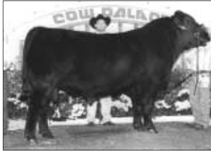
Grand champion bull, Circle A Russ 8595 , by Hi Tor Black Angus, Prineville, Ore. He's a Sept. 1998 son of GDAR SVF Russ 184B.