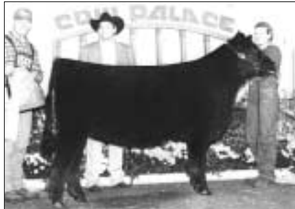
Grand champion female, Kracker Blackbird 935 , by Platinum Cattle Co., Healdsburg, Calif. She's an Oct. 1999 daughter of K Bar D Kruger-rand's Merger.