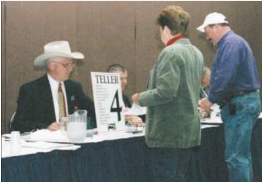
State chairmen officially register their respective state's delegate attendance during the American Angus Association Annual Meeting Monday, Nov. 13.