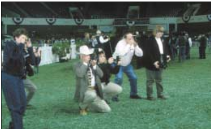
The Angus paparazzi are always in action.