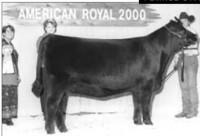
Senior champion, JAC's Maggie 8325 , by JAC's Ranch, Bentonville, Ark. She's a Dec. 1998 daughter of Krugerrand Merger 34.