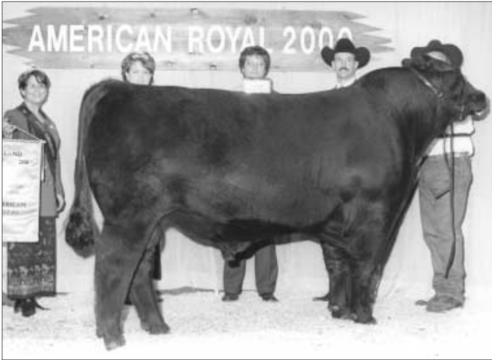
Grand and junior champion bull, WK Poco EXAR , by Whitestone-Krebs and Poco Associates, both of Gordon, Neb.; and Express Angus Ranch, Shawnee, Okla. He's a Feb. 1999 son of OGL Battle Cry 427 128.