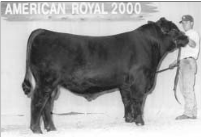
Intermediate champion, EXAR Yukon 9489 , by Express Angus Ranch, Shawnee, Okla. He's a July 1999 son of A&B Yukon 7150.