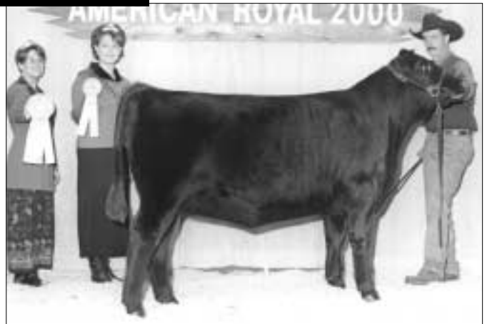
Reserve senior calf champion, KWCC Queen 9139 , by Kisse & Wallace Cattle Co., Mount Vernon, Mo. She's a Sept. 1999 daughter of Pine Creek Traveler 124-1107.