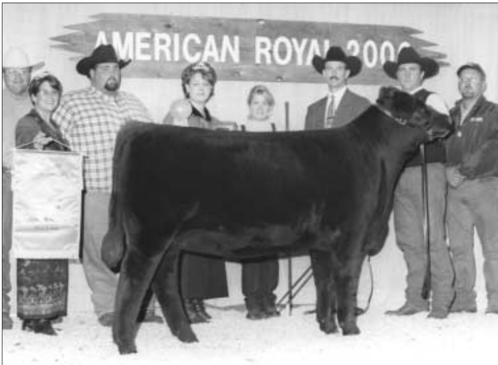
Grand and senior calf champion female, Champion Hill Peg 1763 , by Champion Hill, Bidwell, Ohio; and Fox Cross Farm, Lewisburg, W.Va. She's a Sept. 1999 daughter of LF New Trend 4100.