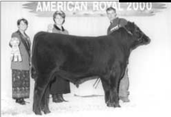
Junior calf champion, EXAR Improvement 0661 , by Express Angus Ranch, Shawnee, Okla. He's a March 2000 son of Northern Improvement 4480 GF.