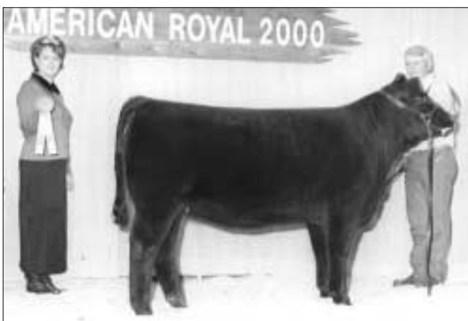
Intermediate champion, SFI Woodhill Pride J116 , by Smith Flooring Inc., Mountain View, Mo. She's an Aug. 1999 daughter of TC Stockman 365.