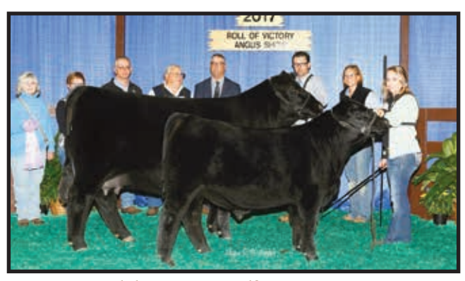
Reserve grand champion cow-calf pair, WCC Migronne C56