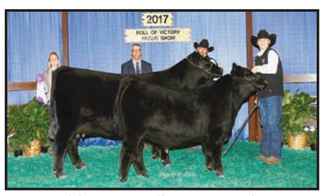
Grand champion cow-calf pair, Top Line Lady 5103