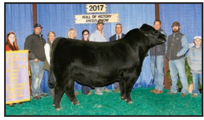
Reserve grand champion bull, KR Casino 6243