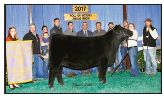
Reserve grand champion female, TopLine FCF Proven Queen 161