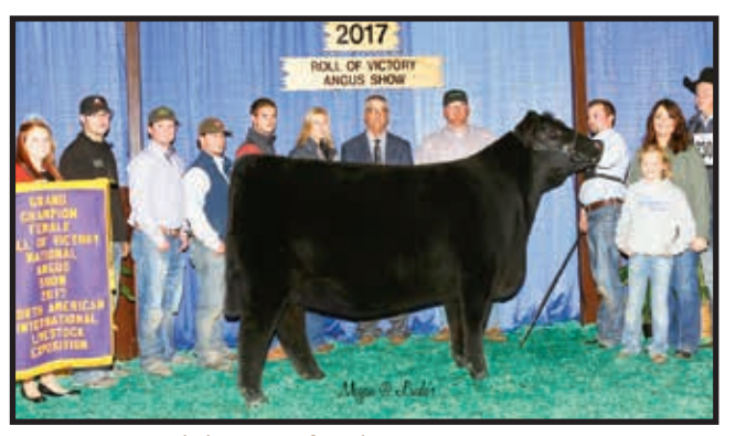
Grand champion female, EXAR Princess 6680