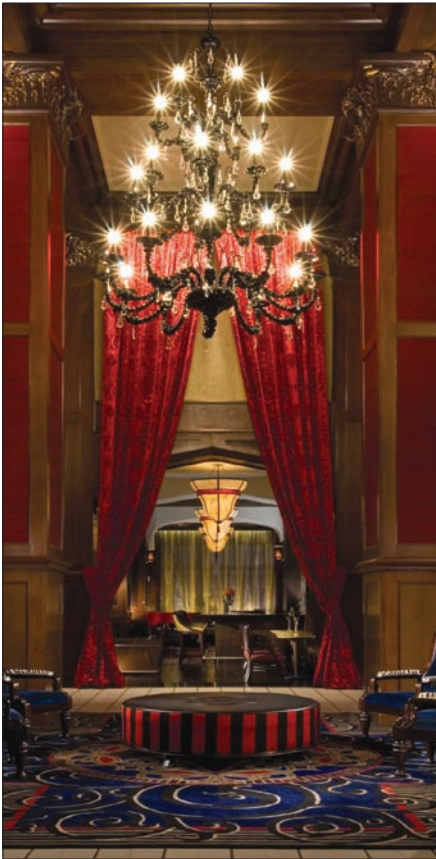
► The official headquarters of “That Old West Magic,” the Skirvin Hilton Hotel located in downtown Oklahoma City will enchant you with its swanky elegance.

Oklahoma City area is the fabulous Skirvin Hilton Hotel, the headquarters hotel of “That Old West Magic.” This 95-year-old historic site underwent a multimillion dollar renovation to restore its original grandeur and now features reconfigured guest rooms and new elevators improving upon the original hotel design. Its elegantly restored lobby, signature restaurant and 225 exquisitely appointed rooms now have all the comforts and conveniences of modern hospitality.