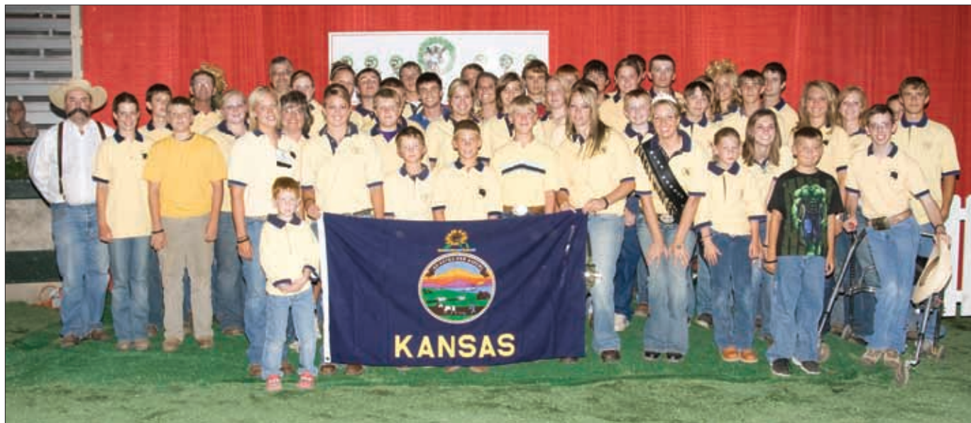
► Winning the sweepstakes award for 30 head or more is the Kansas Junior Angus Ass'n .