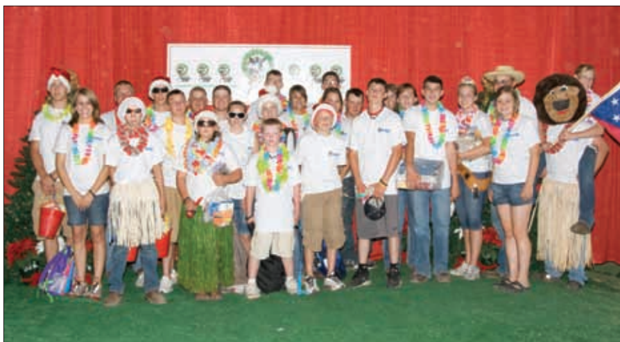
► Winning third place in the scrapbook contest is the Ohio Junior Angus Ass'n.