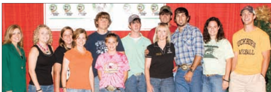
► Members from the Alabama Junior Angus Ass'n collected the most — more than 100 lb. — of aluminum pop tabs for the Ronald McDonald House Charities.