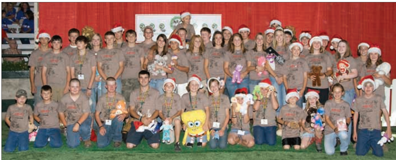
►The Missouri Junior Angus Ass'n won first place in herdsmanship for 61 head or more.