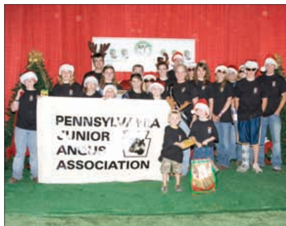
►The Pennsylvania Junior Angus Ass'n won first place in herdsmanship for 16-30 head.