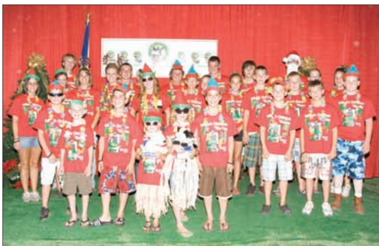
►The Indiana Junior Angus Ass'n won first place in herdsmanship for 46-60 head.