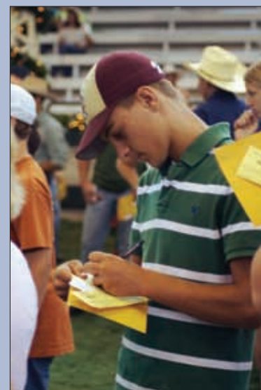
► A junior member marks his card during the livestock judging contest Tuesday.