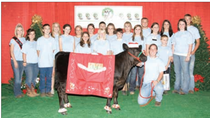
► Winning second place in the scrapbook contest is the Arkansas Junior Angus Ass'n.