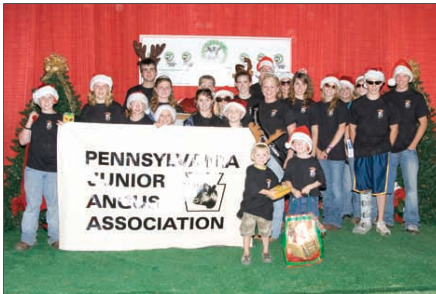
► Winning the sweepstakes award for 29 head or fewer is the Pennsylvania Junior Angus Ass'n .