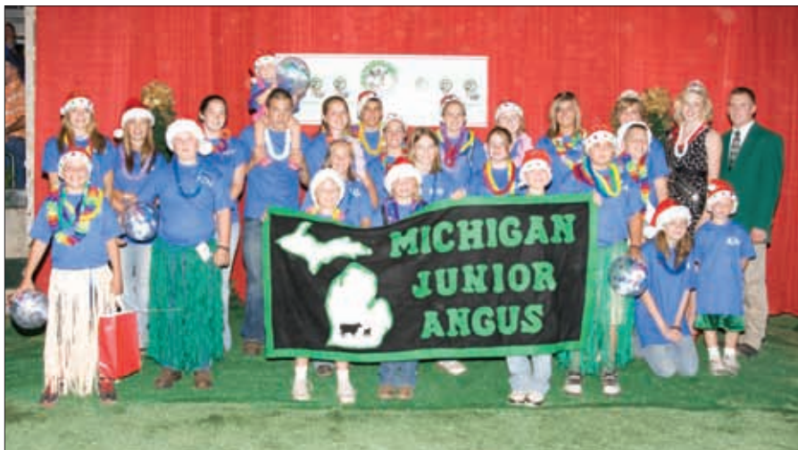
► Winning first place in the scrapbook contest is the Michigan Junior Angus Ass'n.