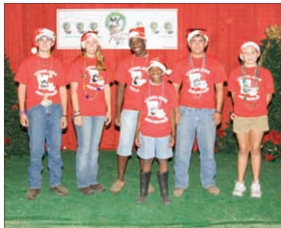
►The Louisiana Junior Angus Ass'n won first place in herdsmanship for 15 or fewer head.