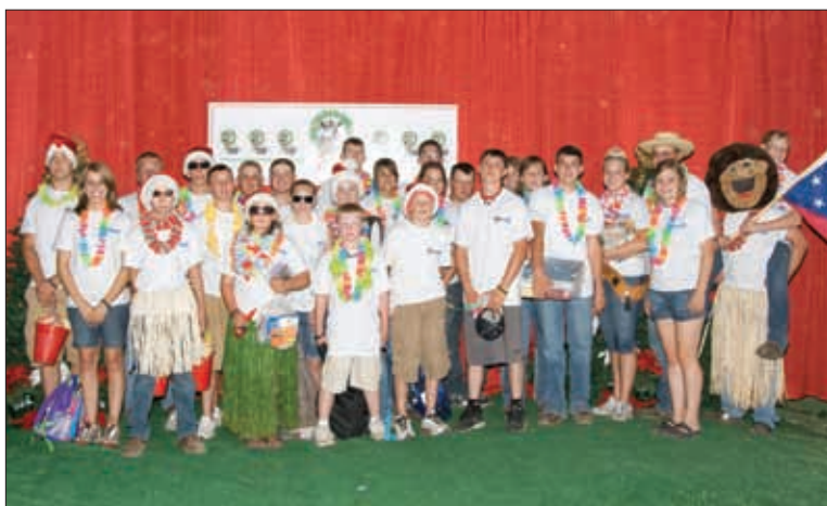
►The Ohio Junior Angus Ass'n won first place in herdsmanship for 31-45 head.