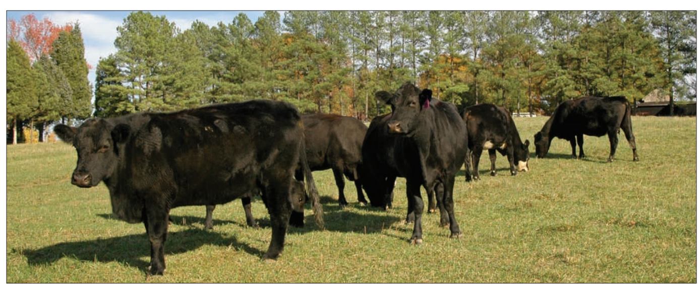
► Under the right conditions, fescue will regrow during the winter.