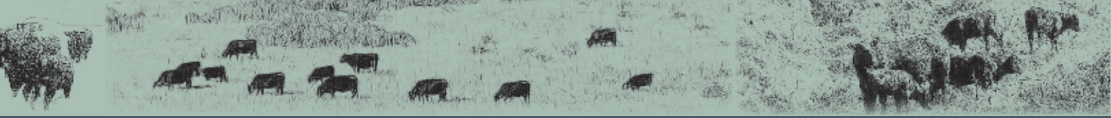
Fig. 1: Biological type and biological efficiency