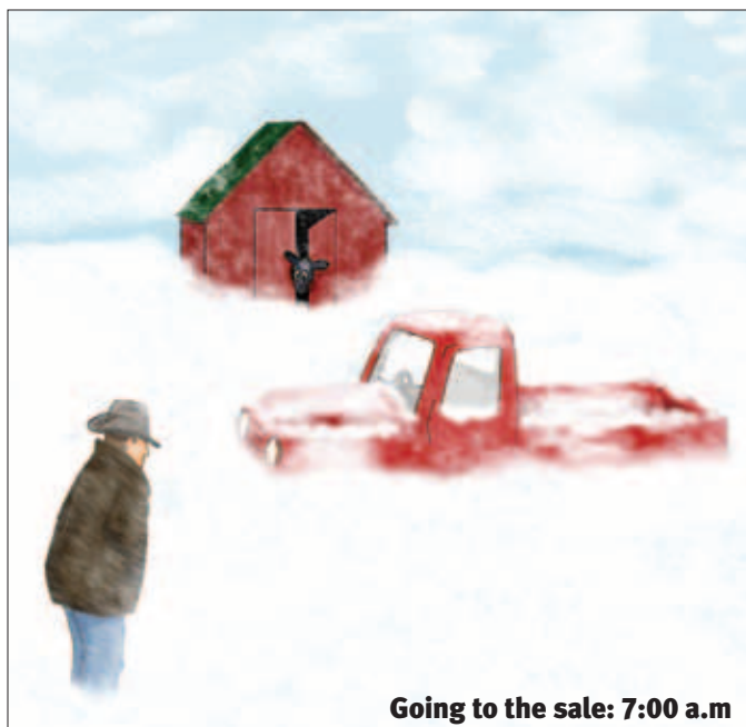
Going to the sale: 7:00 a.m.