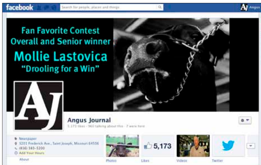
► The contest winners each have their photo posted as the Angus Journal Facebook page cover photo. The Angus Journal posts timely relevant industry information, plus fun pictures and information for the Angus family.

Winners had their photos displayed as the Angus Journal Facebook page cover photo with recognition of the photographer and