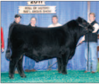
► Senior calf champion, Dameron Business Class , by C5 Angus, Ancona, Ill.; and Dameron Angus Farm, Lexington, Ill.