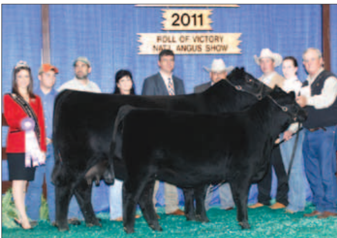
► Grand champion cow-calf pair, JKS Miss Cheyenne 4209 .