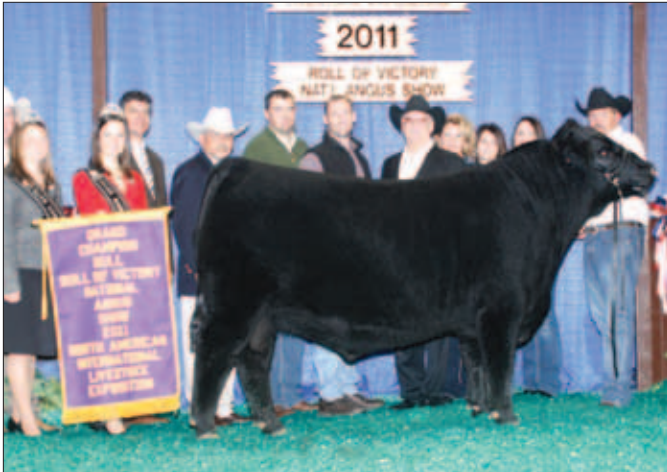
► Grand champion bull, Dameron First Impression .