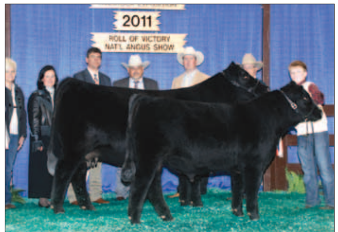
► Reserve grand champion cow-calf pair, APS Forever Lady Ruth .