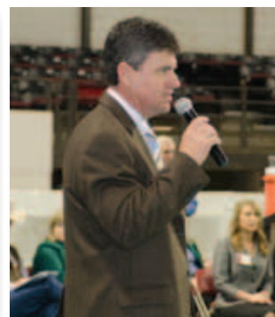
► Brost explains the judges' placing of a class during Monday's ROV bull show. The judges alternated in giving reasons to the audience gathered at the Kentucky Fair & Exposition Center.