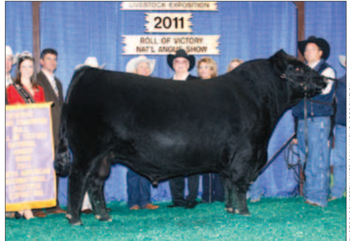
► Reserve grand champion bull, EXAR Wanted 9732B .