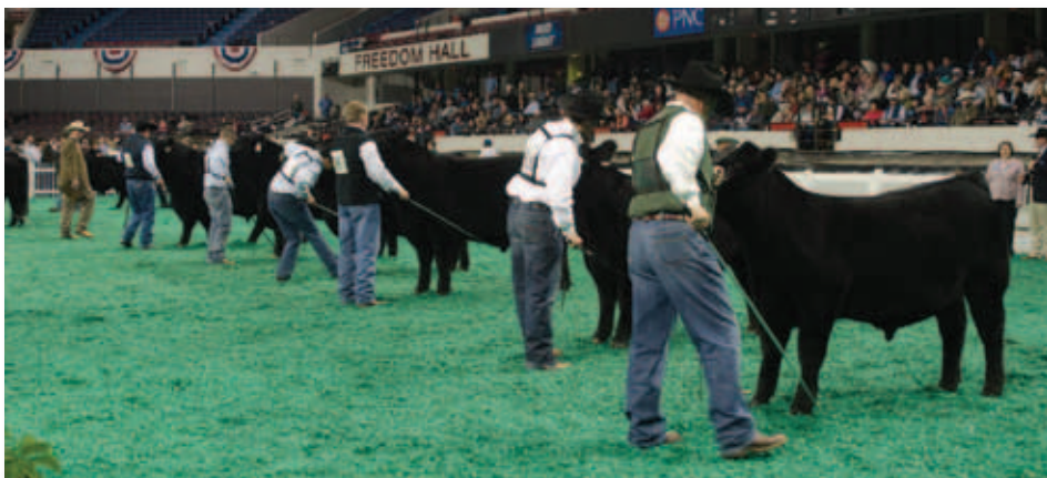
► Division winners line their bulls up for selection of the grand champion bull. Exhibitors showed 35 Angus bulls.