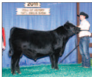
► Winter calf champion, Top Line Kayak 111 , by Top Line Farm, Tremont, Ill.