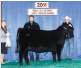
► Reserve senior calf champion, Whitestone Lady Z270 , by Whitestone Farm, Aldie, Va.