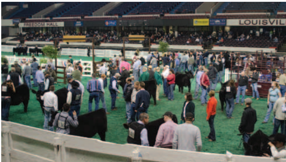
► Angus enthusiasts gather in the preparation area during the ROV female show Nov. 15.