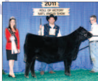
► Reserve spring calf champion, EXAR Envious Blackbird 1760 , by Ashley Cox, Eagle Point, Ore.